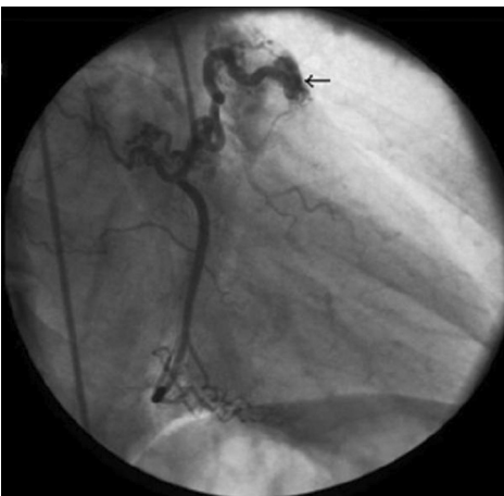
Figure 2. Coronary angiogram showing the CAF arising from the right coronary artery (RCA) to the main pulmonary artery (MPA)