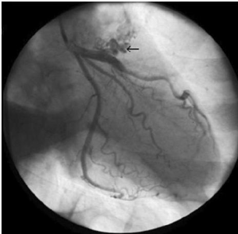
Figure 1. Coronary angiogram showing the CAF arising from the left anterior descending artery (LAD) to the main pulmonary artery (MPA)

diastolic murmur on the left of midline. Electrocardiography revealed a ST elevation on derivations of DII, DIII, V1 and V2. Echocardiography revealed an ejection fraction of 40%, hypokinesia on inferoapical and septal parts of the left ventricle, moderate mitral insufficiency, moderate-severe tricuspid insufficiency and a systolic pulmonary artery pressure of 50 mmHg. A CAF originating from proximal part of LAD (Figure 1) and ostial part of RCA (Figure 2) was detected on coronary angiography and both were drained into main pulmonary artery. Coronary steal syndrome was considered and the patient was decided to be operated on. Operation was done following routine blood analysis and operation preparations had been completed.