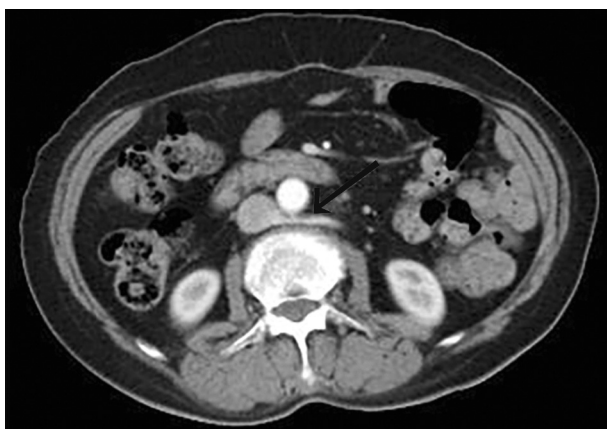
Figure 1. CT images revealed RLRV (red arrow) passing posteriorly to the abdominal aorta

During the laparoscopic exploration the mass was freed from medial attachments and partially mobilized. It was noted that there was no vein drainage from adrenal gland to the inferior vena cava (IVC). Once the mass was gently retracted laterally, an aberrant 0,5 cm wide vein was observed on the superior border of adrenal tissue. This vein was dissected meticulously from the adjacent tissues by using hook cautery. As this dissection completed, right adrenal vein was exposed arisen from accessory right hepatic vein (Figure 2). Adrenal vein was gently ligation with titanium clips and was then divided. Adrenalectomy was completed in a usual fashion. Total blood loss was less than 30 cc. Myelolipoma was rendered in histopathologic investigation.