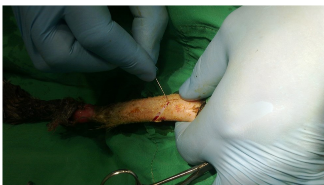
Figure 3. The initial steps of the amputation of the tail, the aspect of the two cuts in the „V“ shape.

The cat was premedicated with medetomidine (Domitor; Orion Pharma Animal Health) 0.08 mg/kg SC, meloxicam (Metacam; Boehringer Ingelheim Vetmedica) 0.2 mg/kg SC and methadone (Metadon Recip; Meda) 0.3 mg/kg. Ketamine (Ketaminol; Intervet) 5 mg/kg was administered intramuscularly to maintain a dissociative anesthesia. Oxygen was delivered by flow-by with the mask during the procedure. With the cat positioned in right lateral recumbency and the tail directed to the surgeon, the surgical site was lavaged with saline respecting the principles of sepsis and antisepsis. Before incising the skin the intervertebral spaces in front and after the chosen tail vertebra for transection were identified by digital palpation. Two v-shaped skin incisions are made at each side of the tail over the middle region of the vertebra with the tip of the v to the direction of the head of the animal and both dividing branches caudally one to the dorsum of the tail and the other to the ventral part (Figure 3).