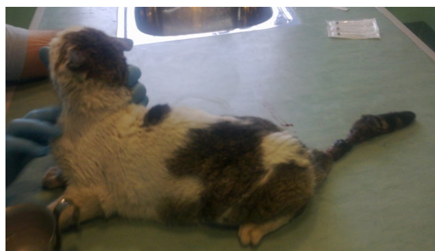
Figure 1. Street, short-haired cat with obvious tail injuries.

cat was admitted to a private veterinary outpatient office, where osteomyelitis was diagnosed in the tail. The patient had no fever and the general condition was in good state. It was frightened and aggressive, but with good appetite, and no substantial difficulties on physical examination. The open wound with substantial soft tissue defect was dirty, covered with pus and producing unpleasant smell. There was no obvious tail fracture. The perianal and periurethral area were unaffected with trauma. The sensory as much as urinary/fecal continence were preserved.