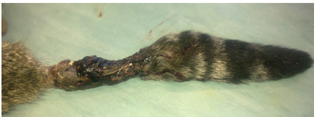
Figure 2. Aspect of long-lasting, untreated sanguinolent-purulent discharge of the tail.

Leukogram showed signs of leukocytosis, neutropenia, monocytosis, basophilia and eosinophilia (Table 1). The animal was