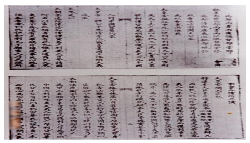
Figure 2: Lin Zexu's Letter to Queen Victoria