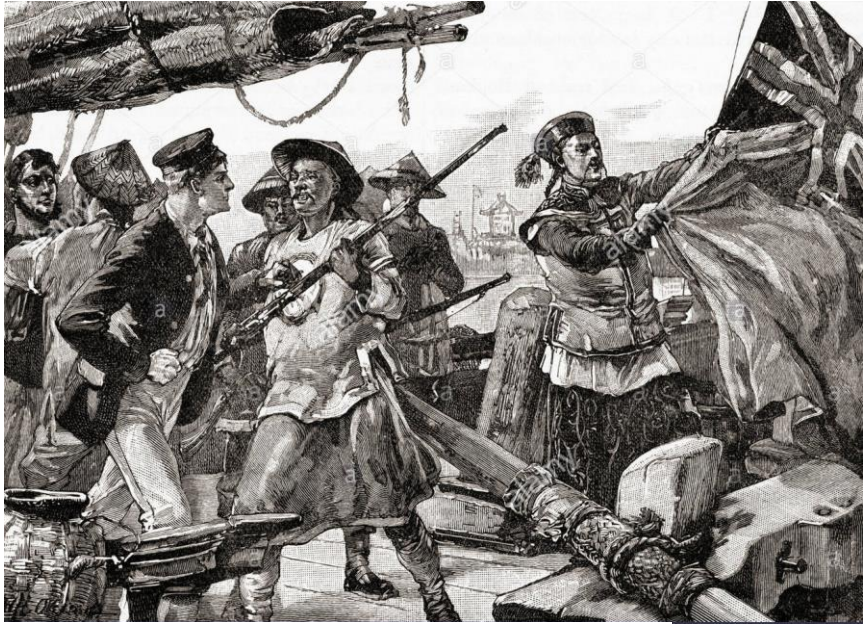
Figure 5: Arrow Incident, 1856

Source: William Heyshend Overend, via Wikipedia Commons