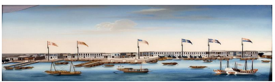
Figure 1: Trade Port of Guangzhou (Canton)

Source: Canton Harbor and Factories with Foreign Flags, c. 1805 Peabody Essex Museum 2007, via Massachusetts Institute of Technology