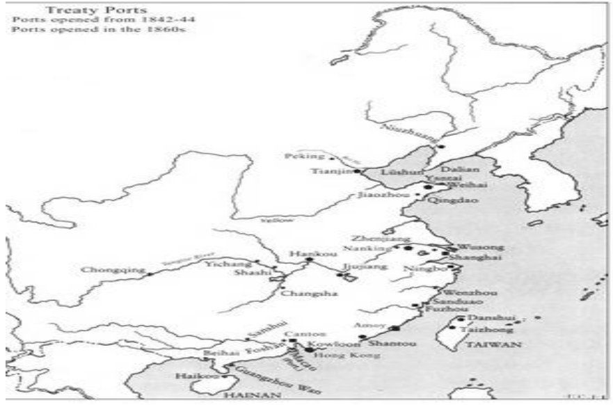
Figure 4: Chinese Seacoast