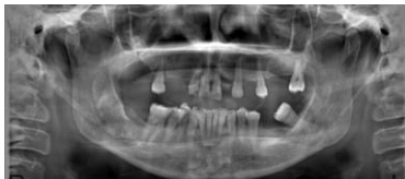
Figure-1. Panoramic radiograph shows bilateral elongated styloid process.

An OPTG was taken by Morita panoramic radiography machine (Morita, veraviewepocs 2D, USA). OPTG machine was operated at 72 kV, 9 mA and 8 sec. The OPTG revealed the presence of bilateral elongated styloid process (Fig.1). Therefore, cone-beam computed tomography (CBCT) was taken for differential diagnosis of Eagle Syndrome. The CBCT image was acquired using a Planmeca CBCT machine (Planmeca, Promax 3D max, Helsinki, Finland). CBCT machine was operated at 90 kV and 10 mA with a 9x16 cm field of view. Images were reconstructed with Romexis, the proprietary software of Planmeca. Voxel edge length was 0.2 mm and slice thickness was 1 mm.