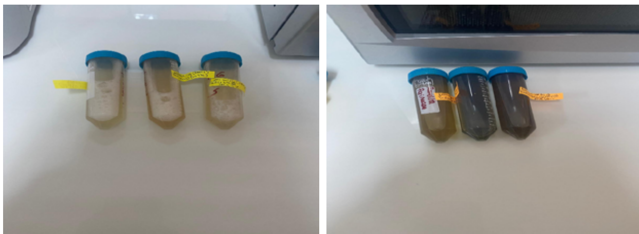
Figure 1. Extracts of three lichen species prepared using acetone (a) and distilled water (b)

stored at -20\text{ }^{\circ}\text{C} until use to maintain sample integrity and prevent degradation of bioactive components.