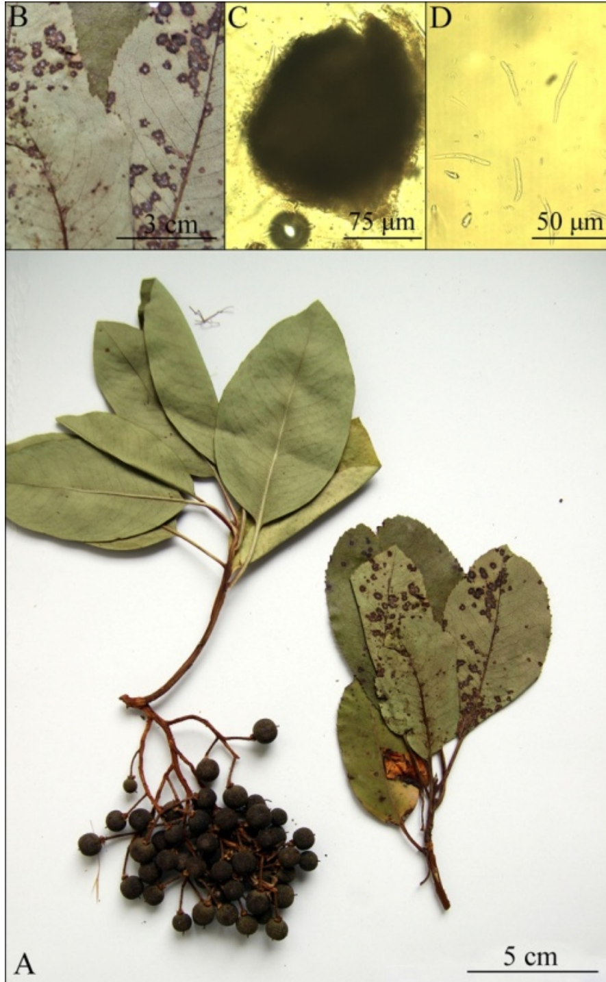
Figure 2. S. alnicola on Alnus glutinosa A- dried herbarium specimen; B- infected plant leaves; C- LM view of Pycnidium; D- LM view of Conidiospores.

22.05.2014, Ş. Kabaktepe & I. Akata 7482; Mersin: Çamlıyayla, Kadıncık valley, Kuzbağı located, 1300-1350 m, 26.06.2015, Ş. Kabaktepe & I. Akata 8140; Mersin: Çamlıyayla, Fakılar, Kadıncık valley 9. km, 680-700 m, 26.08.2015, Ş. Kabaktepe & I. Akata 8194.