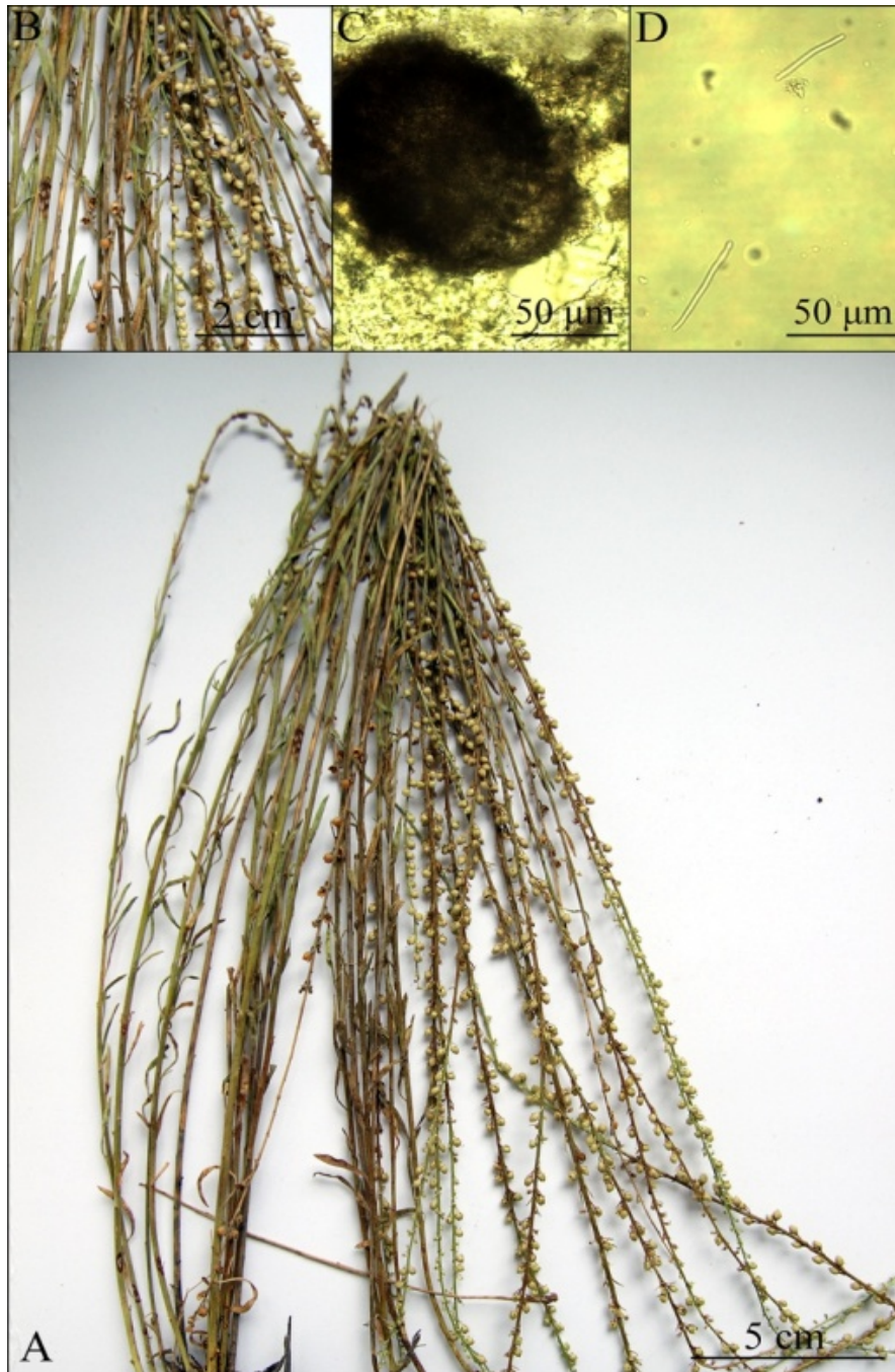
Figure 3. S. antirrhini on Antirrhinum majus A- dried herbarium specimen; B- infected plant; C- LM view of Pycnidium; D- LM view of Conidia

Specimen examined: On Antirrhinum majus L. ( Plantaginaceae ), Niğde: Ulukışla, 8–10 km south Emirler village, 1800–1900 m, 13.07.2014, Ş. Kabaktepe & I. Akata 7528.