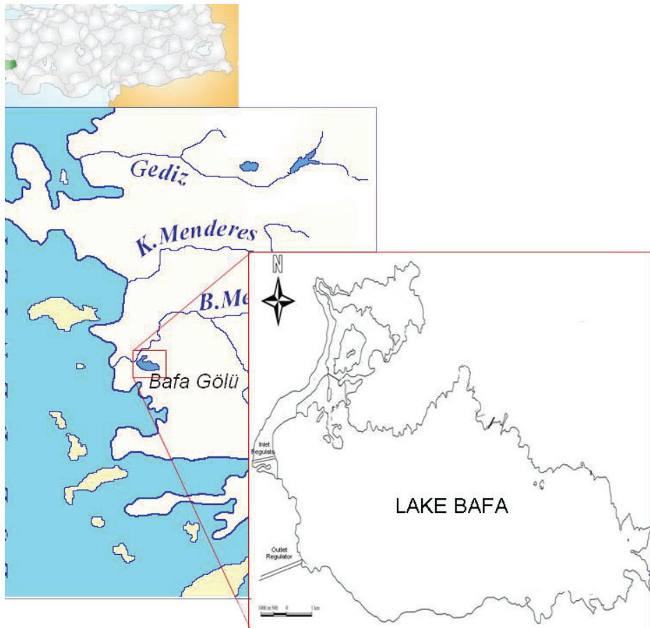
Figure 1. The location of study area.

However this sediment accumulation is accelerated in the last millennium with increasing anthropogenic activity. Increased siltation by Büyük Menderes flow and gradual integration of Milesian Peninsula into the floodplain occurred between 4 th -14 th centuries. This process is finalized with definite sediment accumulation at all parts of the bay and total loss of access to the open sea in the last 500 years (Brückner et al., 2006).