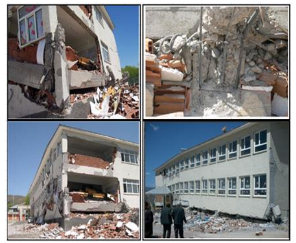
Figure 1. Çeltiksuyu Regional Primary Education School Building

The primary school of Çeltiksuyu built in 1990's and heavy damaged during the May 2003 Bingöl earthquake (Figure 1).