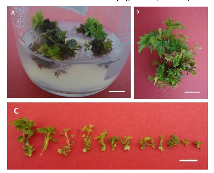
Figure 3. The shoots obtained from the cotyledon explants on medium supplemented with NAA and BAP combination in 8-week culture. (A) and (B): Shoots observed on medium added 0.10 mg L<sup>-1</sup> NAA + 1.0 mg L<sup>-1</sup> BAP, (C): Shoots separated from each other whose obtained on medium containing 0.15 mg L<sup>-1</sup> NAA + 1.0 mg L<sup>-1</sup> BAP (Bar: 1 cm)

The highest average shoot number per explant was observed from hypocotyl explants when used 0.10 mg L^{-1} IBA + 1.0 mg L^{-1} BAP combination (32.20 shoots/explant) followed by 0.05 mg L^{-1} IBA + 3.0 mg L^{-1} BAP combination (31.00 shoots/explant) (Table 1). In cotyledon explants, the highest average shoot number was obtained (30.89 shoots/explant) in 0.10 mg L^{-1} NAA + 1.0 mg L^{-1} BAP combination (Figures 3A and B). The highest shoot formation was detected on the medium containing 0.10 mg L^{-1} NAA + 3.0 mg L^{-1} BAP (76.64%) where average shoot number per explant were found 19.50 from hypocotyl explant (Table 1). Shoots formed in combinations with NAA of BAP grow better than the combinations with IBA of BAP (Figures 3A, B and C).