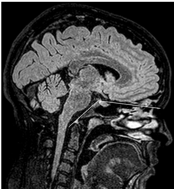
Figure 1. Modified basal angle in sagittal FLAIR weighted-image 2. Clivo-axial angle (CAA); is the angle between the line extending from dorsum sellae to basion and the line drawn along the boundary superoposterior and inferoposterior corners of the C2 vertebrae [3,6-8] (fig 2).