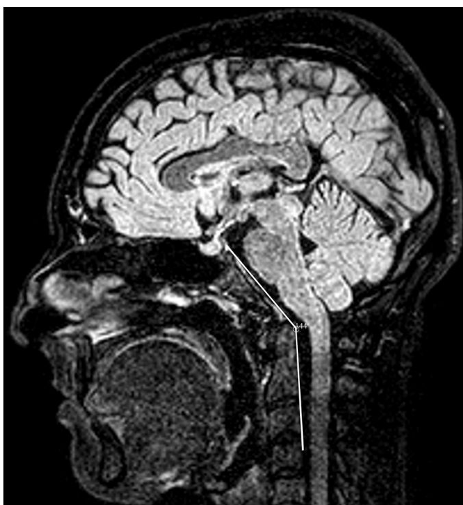
Figure 2. Clivo-axial angle in sagittal FLAIR weighted-image

3. Basilar invagination; according to McGregor and Chamberlain line, the superiority of the odontoid process was evaluated (fig 3).