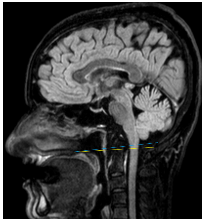
Figure 3. Basilar invagination in sagittal FLAIR weighted-image, the Chamberlain line (blue), the McGregor line (yellow)

3. Basilar invagination; according to McGregor and Chamberlain line, the superiority of the odontoid process was evaluated (fig 3).