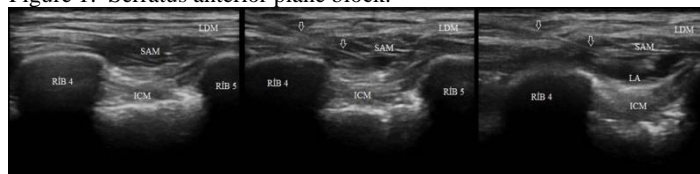
Figure 1: Serratus anterior plane block.

SAM: The serratus anterior muscle, LDM: The latissimus dorsi muscle, RIB 4: 4 th rib, RIB 5: 5 th rib, ICM: The intercostalis muscle, LA: local anesthetic, Arrows: Needle