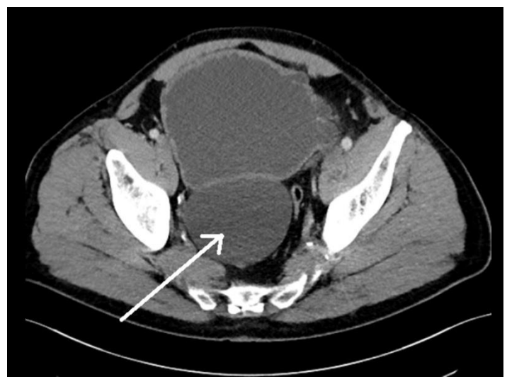
Figure 2. An axial computed tomography scan showing bladder diverticulum located at the base of the urinary bladder (white arrow).