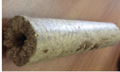
Figure 1. Photo of agricultural pellet used in the study

(Figure 1). Elemental and proximate analyses of the agriculture stalks pellet were determined by same methods describe above (Table 1-2).