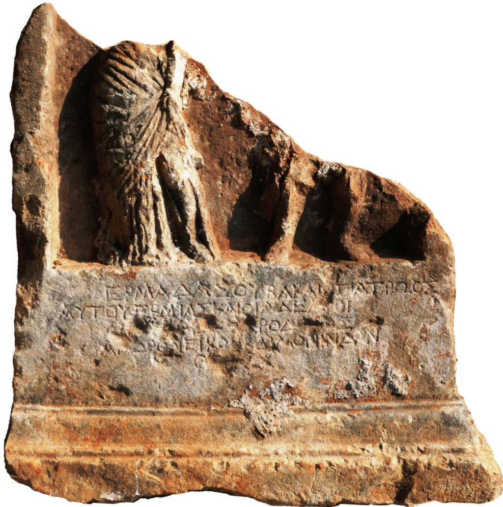
Fig. 1. The grave stele of Andronikos and Moninda in Sura

Anahtar Sözcükler: Lykia; Roma yolları; Phellos; Kyaneai; Myra; Claudius.