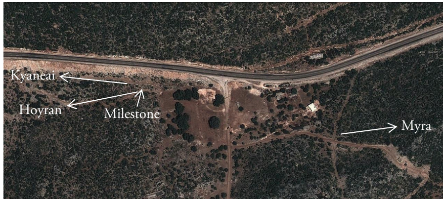
Fig. 7. Çakalbayat