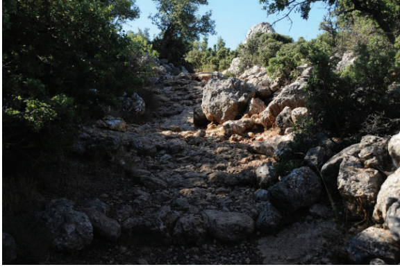
Fig. 2. Ambararası Mahallesi – southern slope of Köletpesi