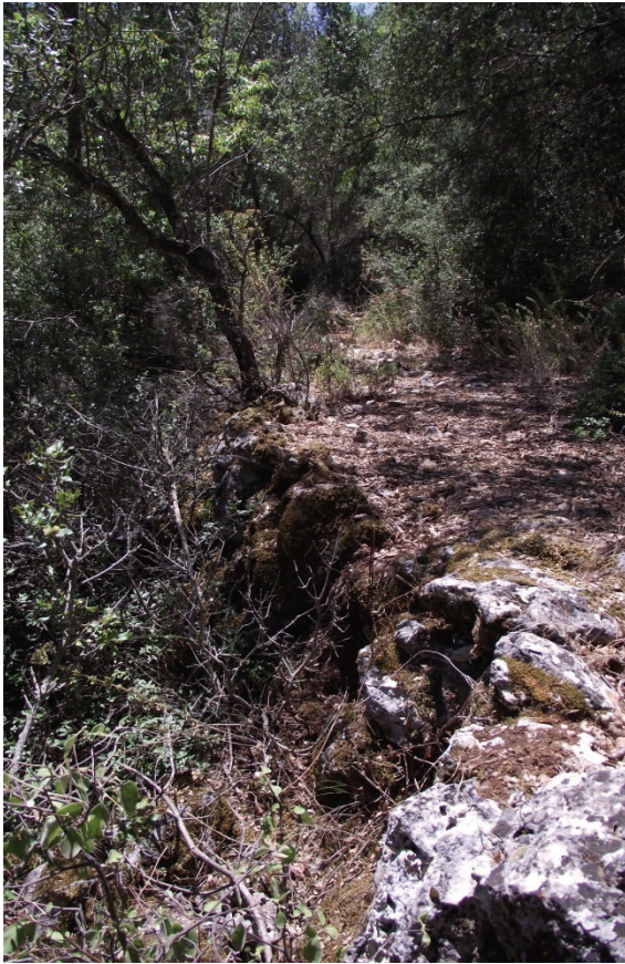
Fig. 8. Ancient road on the west bank of the Eğridere