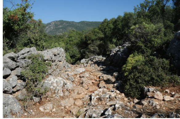
Fig. 3. Ambararası Mahallesi – southern slope of Köletpesi