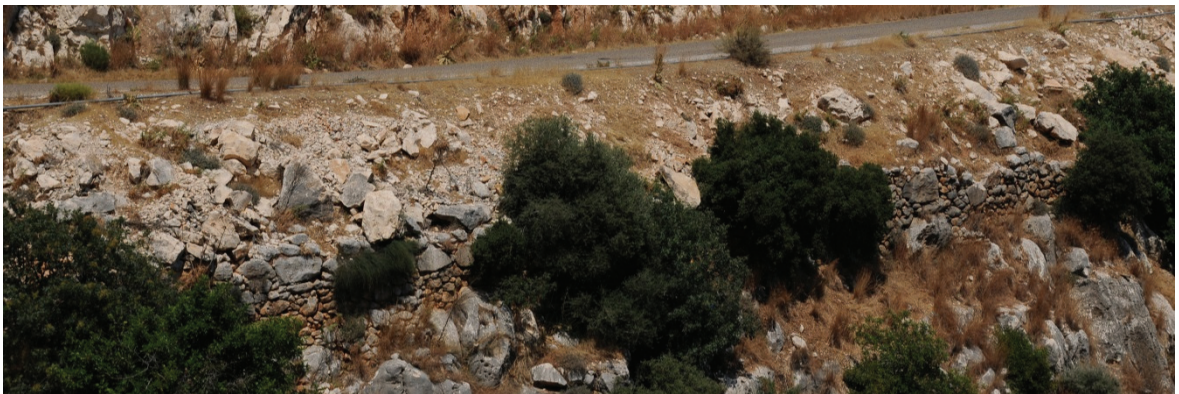
Fig. 11. The retaining walls of the road to Myra near Sura, beneath the modern road