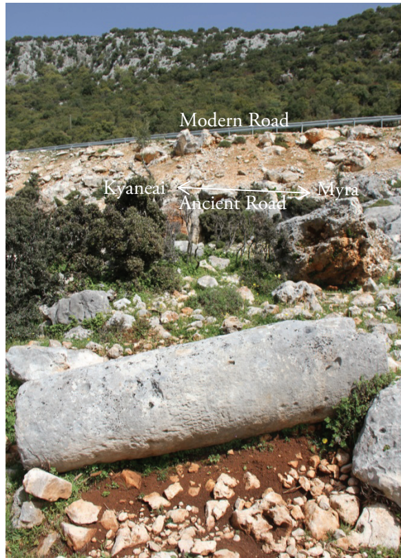
Fig. 5. Çakalbayat – Milestone