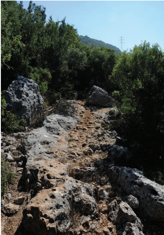
Fig. 4. Gölbaşı, ancient road