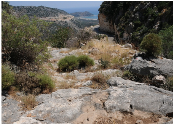
Fig. 10. Ancient road on the east bank of the Eğridere