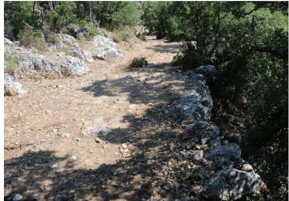
Fig. 9. Ancient road on the east bank of the Eğridere