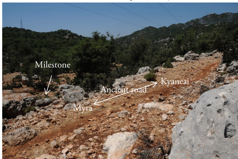
Fig. 6. Çakalbayat– Ancient Route