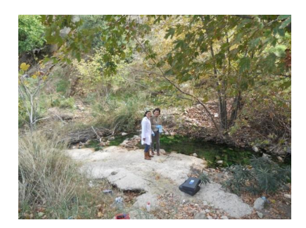
Fig 1. Sampling area