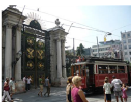
The heart of the district with the entrance of famous French Galatasaray High School and Yapı Kredi Publications

The Beyoğlu axle is also defined as an intensive music and entertainment venue. The dichotomy of subcultures and dominant culture shows itself in the form of different places, and musics. Music in this area is indispensible. It is possible to hear the music played at CD stores along the street at entertainment venues too. The aim here is to get away from everyday life and get involved, if only for a while, in a completely different world one aspires to but does not belong in. This is where the distinction between high culture and mass culture disappears. After 1980, Istanbul in general witnessed a serious growth in the manner of social gaps, where a poliarized system occurred. The crisis of elitist culture resulted in a dichotomy, which was indicated in new settings of meanings. Especially in Beyoğlu this resulted in a shift of paradigm, where the legitimization of arabesque is approved. According to Yarar, it presents a symbol of of spontenous reaction by the popular masses to officialdom and to forced modernization (Yarar, 2008)