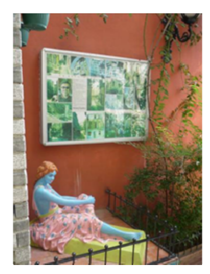
Entrance of French Street reminding people the assumed "European" look, and history

The French Street (in Origin Algerian Street) was actually created to articulate a French look, although the district has never been a French neighborhood. The aim of the gentrification was to recall of a collective memories of minorities from past times. Shaping the district as a "cultural "arena was not quite successful, where only cafes, and small restaurants are trying to keep the street alive, with very little support of cultural activities.. As quoted in Mill's work from Idemen ve Düzkan, the street become a very loud and noisy place for drinking and eating late into the night and that little "cultural" activity actually took place (Idemen, Düzkan, 2005).