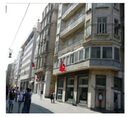
Examples of restorations in Beyoğlu street

Almost every single historical building in Beyoğlu is out of its original use. The past live is already over; but the fact that the area has an reclaimed Europen illusion is open to discussion. Except The arrival of global brands, increase in the cultural activities, and attempts to start a revival for European period under the "French Street" reproduction, the only reality is that these buildings are living, as Akın says a kind of 'belle epoque' (Akın, 1998).