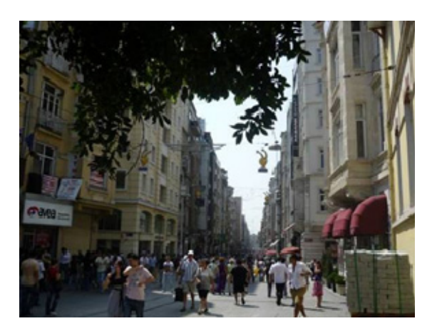
Beyoğlu... An overview to the street.

The history of Beyoğlu goes back a long way. It is known to have been a vibrant and dynamic area, particularly popular among Genoese and Venetian tradesmen. Armenian and Jewish minorities in the region formed the first bourgeois in the western sense with embassies, churches and synagogues, bringing with them all the characteristics of a European life style.