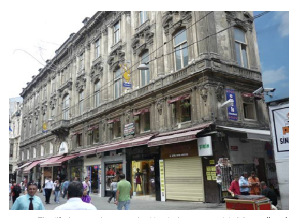
The life keeps going even the historical monumental building suffers from severe demolishment