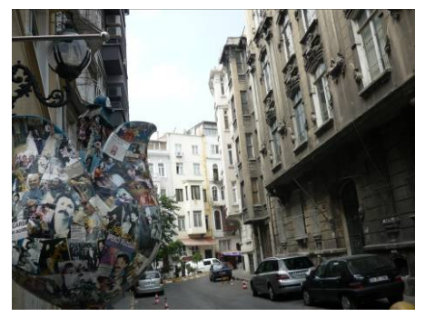
A view from historical buildings of Beyoğlu, abandoned or mistreated with inappropriate interventions

From this perspective, it can be said that the monumental and aesthetic Art Nouveau architecture of the Levantine era has been abandoned to its fate. The residences, business centers and shopping malls built in a straightforward fashion to reflect social status do no longer exist here. An architectural structure