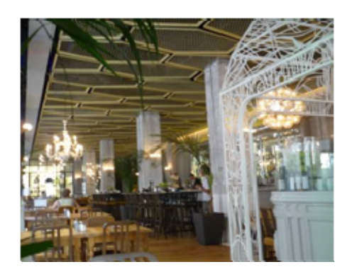
Different kind of eating places in Beyoğlu, one from a traditional Turkish cuisine "mantı house", the other a restaurant with an international cuisine...