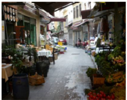
Little vernacular food shops, and neighborhood open bazaars

Corner shops, little vernacular food shops, and open bazaars along the streets which are scattered all over the city are widely existent and can be seen at every step in this area. Everything is ready to be consumed on the spot, with various alternatives lined up.