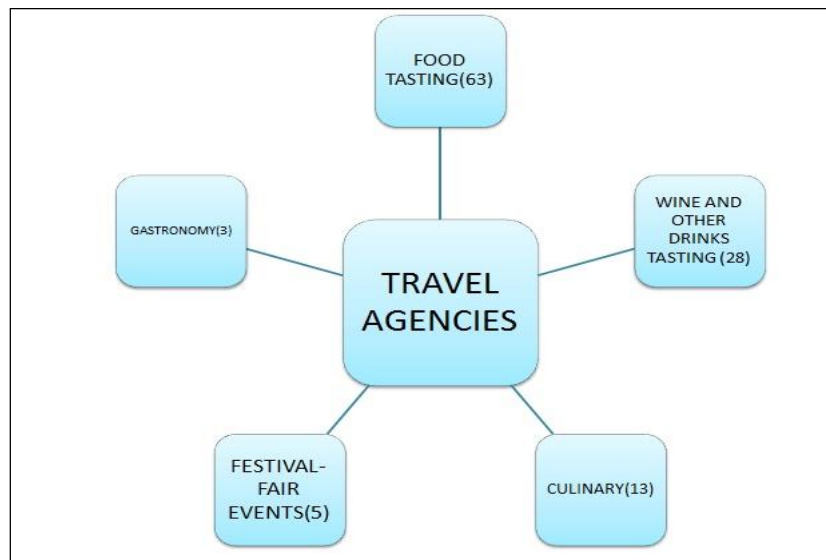
Figure 4. Gastronomic Services Organized by Travel Agencies

It is detected that travel agencies take the gastronomical dynamics of the destination into consideration when they prepare the tour programs. The destinations which are prepared on the gastronomy base are; in Marmara Region İstanbul and Edirne, in Black Sea Region Trabzon, in Aegean Region Şirince, in Southeast Anatolia Region Gaziantep, in Central Anatolia Region Eskişehir and in East Anatolia Region Erzurum and Van were observed as the distinguished destinations.