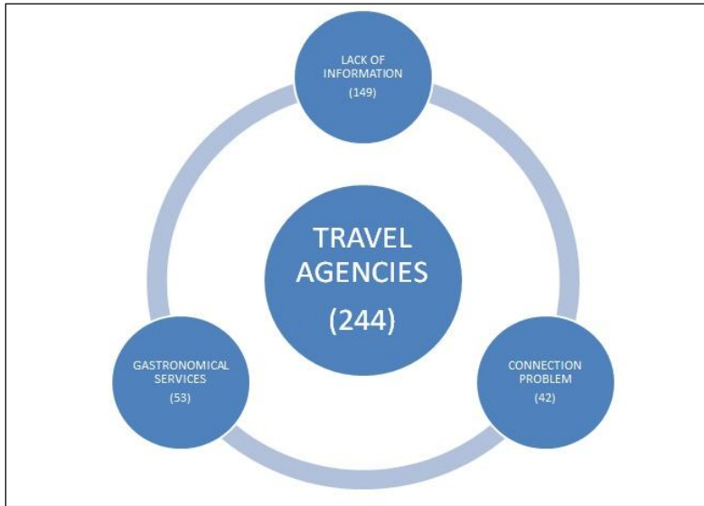
Figure 1. Informations on Promotion and Presentation of Gastronomic Services

The fact that some of the agencies, which was examined in the scope of the research, do not include gastronomic services because of their roles in the market was observed. For example, the travel agencies, which organize Hajj and Umrah tour, Jerusalem tour or Mediterranean tour, highlight the services that is at the focus of the market they operate in instead of offering gastronomic services.