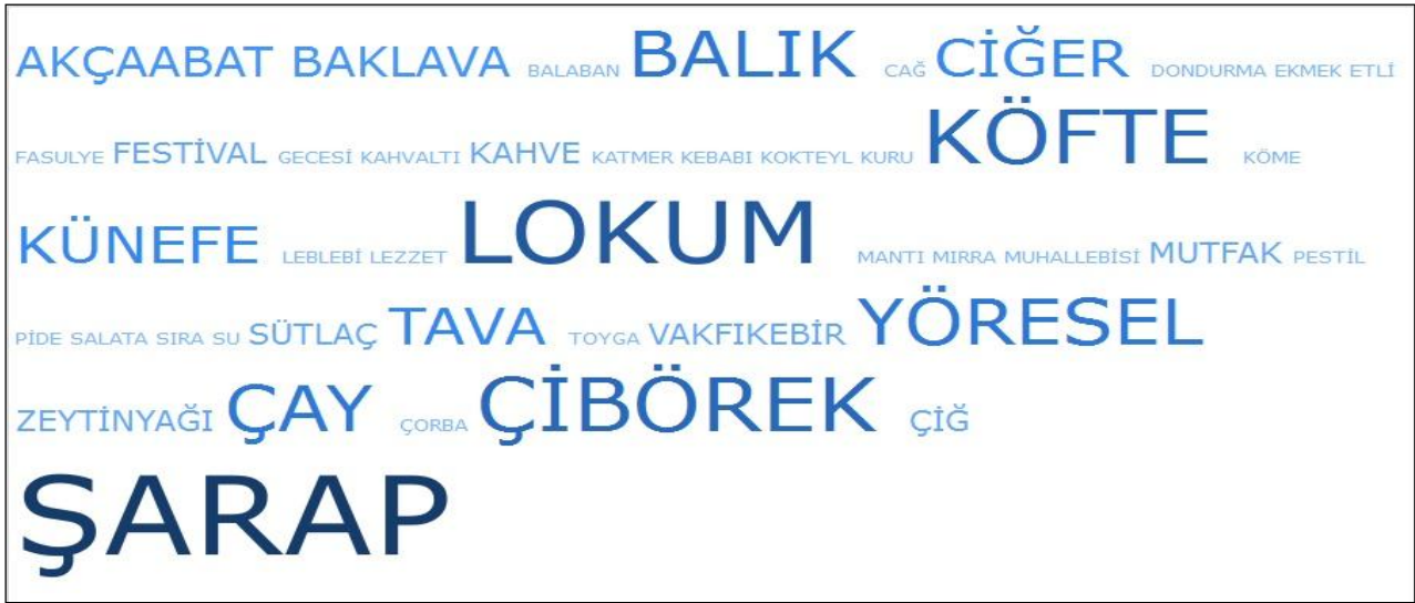
Figure 5. Frequently Highlighted Items During Tours

Tour programs may vary according to the unique gastronomical values of the destinations. In this respect, some destinations step forward in terms of food, beverage and other services. In domestic tours, in terms of beverages it is observed that wine, tea and coffee tasting are popular. In terms of food, çibörek, lokum (Turkish delight) and fish have an important place. When other gastronomical services are examined; it is seen that “locality” point is frequently emphasized.