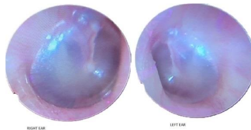
Figure 1. Otoscopic view of ears

A 27-year-old young patient applied to the ENT outpatient clinic with the complaint of fullness in both ears. He had complaints for about 2-3 months. He traveled abroad by plane and his complaints increased. He had not any operation before. Family history was none specific. He was using Continuous Positive Airway Pressure (CPAP) during sleep for Obstructive Sleep Apnea Syndrome (OSAS) treatment. On physical examination his nose acute sinusitis was present. Septum was deviated to the left. Nasopharynx was natural. Ears: Both tympanic membranes appeared natural. In audiometry tests patient had bilateral mild conductive hearing loss in pure tone audiometry, The tympanometry test is done by Interacoustics Basic AT235 Tympanometry at 226 Hz and the right ear peak was measured as +124 daPa (126 mmH 2 O) and 1.82 ml Left ear peak was +110 daPa (112 mmH 2 O) and 1.75 ml peak was measured in the tympanometry test . The patient received medical treatment.