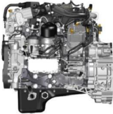
a) Renault Truck DT15 Euro 6 engine, 841 parts

The following figure, Figure 2, illustrates some 3D printer applications of various parts of different automobile brands. Apart from these, there are many more applications available which will be detailed in the full text version of this study and necessary explanations on these applications will be made.