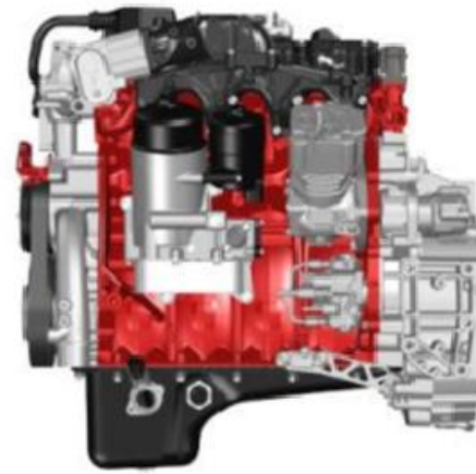
b) Renault Truck DT15 Euro 6 engine designed with 3D 3B metal printing technology