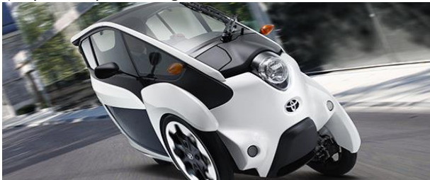
e) Toyota's i-Road vehicle whose many parts were printed with 3D printer