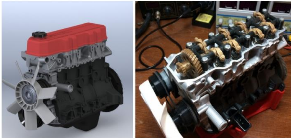
c) Toyota 4 Cylinder Engine 22RE Model