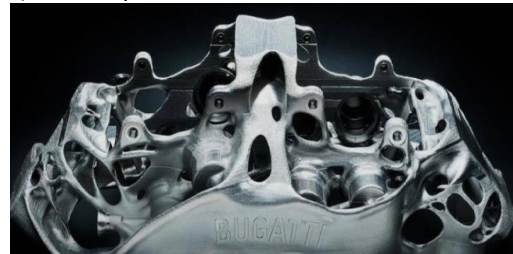
f) Bugatti's brake calipers manufactured with the 3D printing technology