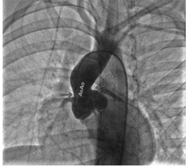
Figure 2. Aortography was performed before the operation, and all demonstrated a typical hour-glass type stenosis of Case 2.