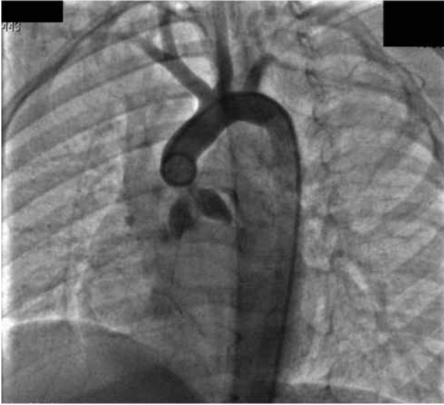
Figure 1. Aortography was performed before the operation, and all demonstrated a typical hour-glass type stenosis of Case 1.