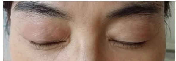
FIG. 2. Swelling and redness of both upper eyelids, consistent with a heliotrope rash.