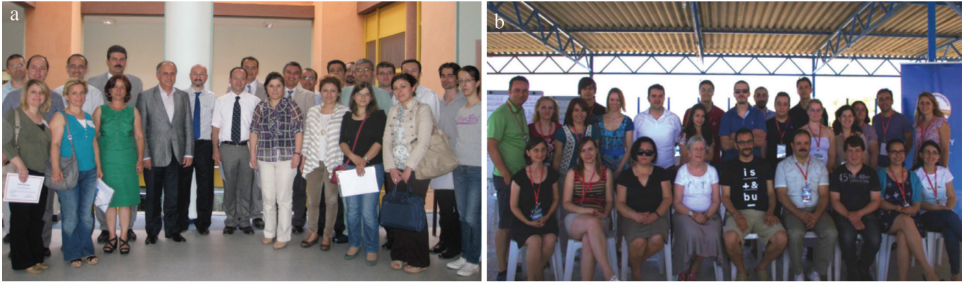
FIG. 8. a, b. The Balkan Medical Journal has a national and an international training mission. Training of authors program, attended by all editors of the Balkan Medical Journal, was held for the first time in the Central Library Halls of Trakya University on May 30, 2013, as a national scale of the training mission (a). In 2014, the 11 th session of the International Scientific Summer School was organized in Edirne under the patronage of the Balkan Medical Journal with the support of Trakya University as an international scale of the training mission (b).