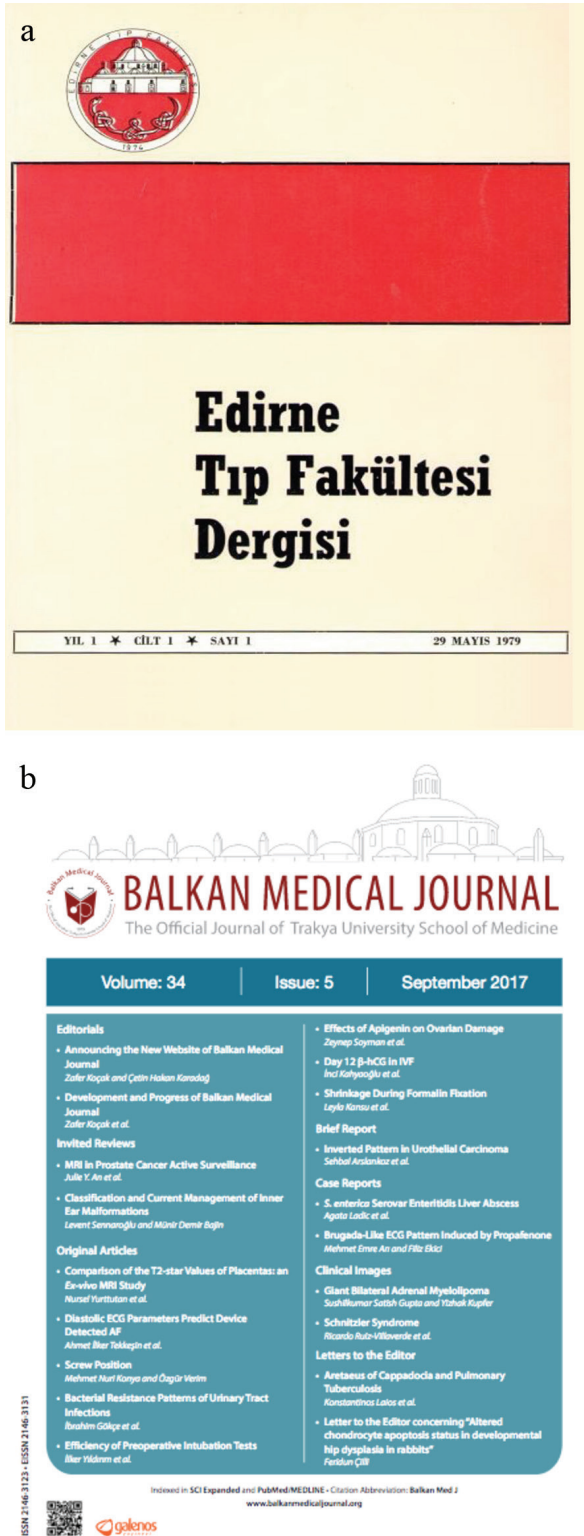
FIG. 10. a, b. The Balkan Medical Journal had its beginning under the title of “Edirne Tıp Dergisi” (Edirne Medical Journal) in May 1979 (a), In 2011, the title of the journal was changed to “Balkan Medical Journal,” and the current cover of the journal began to be used from the third issue of 2017 onward (b).