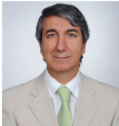
FIG. 4. Professor Erol Yalnız was the Editor-in-Chief between 2002 and 2005. In 2003, the journal was indexed in an international database (Index Copernicus) for the first time.

In 2002, Professor Yalnız was appointed as a new Editor-in-Chief of the journal (Figure 4). Only a year later, he announced that Index Copernicus was the first international database where the journal was indexed. Despite this great news of those years, the primary source of submission was still Trakya University School of Medicine in Edirne (Table 1).