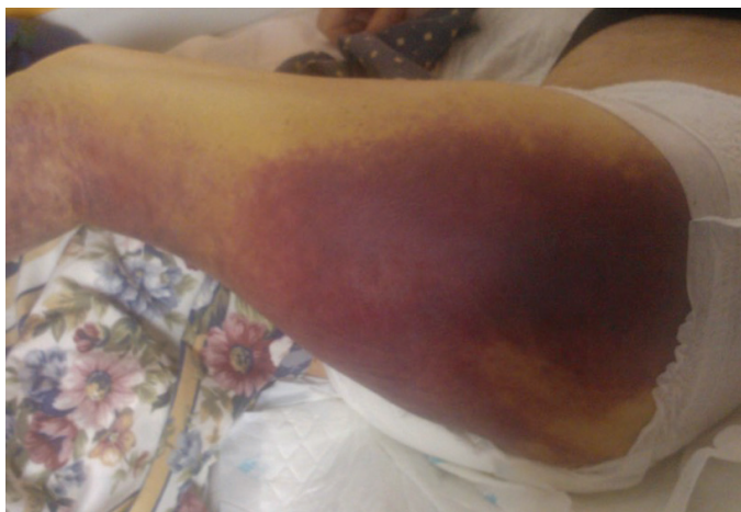
FIG. 1. Extensive ecchymosis on the patient's left thigh.

The irreversibility of the patient's clotting assays through exogenous clotting factor transfusion and LMWH antidote (FFP and protamine sulfate accordingly), and the inability to