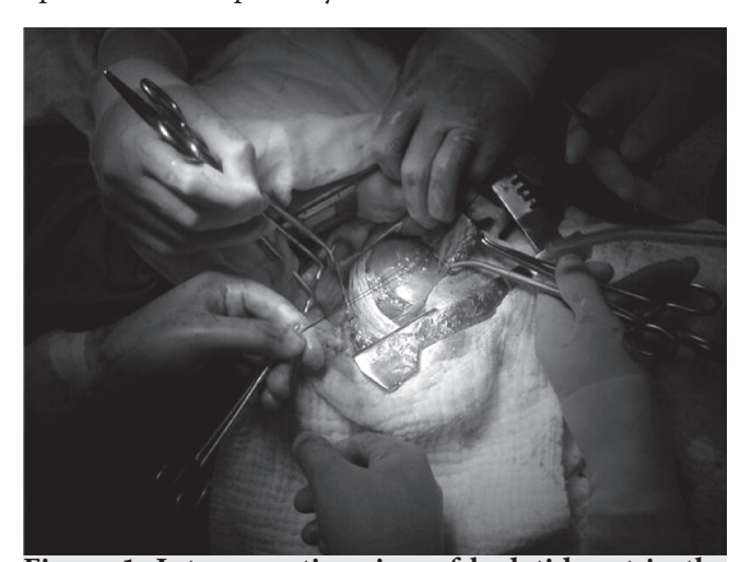
Figure 1. Intraoperative view of hydatid cyst in the dome of the liver.

A total of 10 cases of hydatid cyst located in the dome of liver were operated on using a transthoracic approach. The patients comprised 5 males and 5 females with a mean age of 37.7 years (range, 16-52 years). One female had 3 cysts, 1 had 2 cysts, and a solitary cyst was determined in the remaining patients. All cysts were diagnosed by ultrasonography. Computed tomography (CT) was applied to the abdomen to evaluate the nature and exact location of the cyst in order to plan the surgical approach ( Figure 1 ). Thoracic CT was applied to assess the presence of thoracic hydatid cysts. The diameters of the cysts ranged between 6 and 18 cm. All operations were primary.