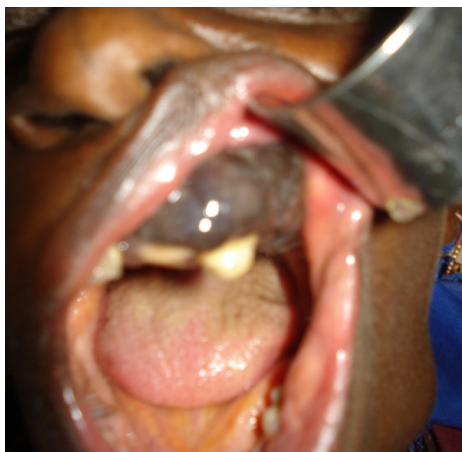
Figure 1. Left sided nodular masses, involving the anterior two-thirds of the hard palate

A total of 107 malignant melanoma cases were diagnosed within the study period. Of these, seven females and three males had oral cavity tumours. The ages ranged from 27 years to 80 years with a mean of 49.8 years. They presented collectively with varying symptoms of painful bleeding gum, gum discolouration, palatal swelling, maxillary swelling, lower jaw swelling, black sessile oral mass, epistaxis, facial swelling and proptosis. The symptom duration was from 2 months to a year while one patient re-presented with disseminated disease a year later following initial incomplete tumour excision. Two patients gave a history of tooth extraction while the 80 year old elderly female was edentulous. None of the patients gave a positive history of previous oral lesions. All had poor oral hygiene and examination revealed left sided nodular masses in five cases, involving the anterior two-thirds of the hard palate (Figure 1), associated unprovoked bleeding gum and loosened teeth. One female had a 5 cm base sessile nodular mass extending to the inner aspect of the upper lip and one male had a