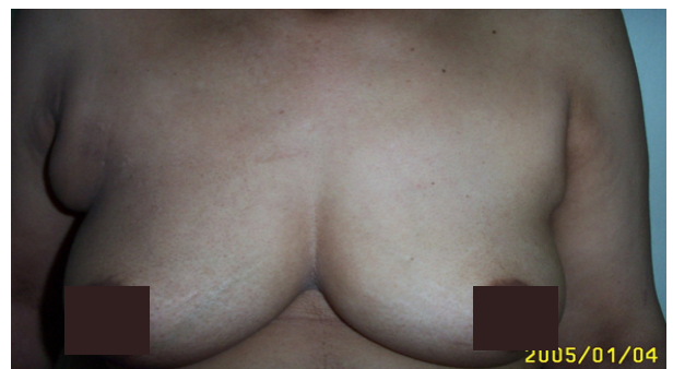
Figure 4. Clinical picture showing cosmetic outcome after 69months post treatment