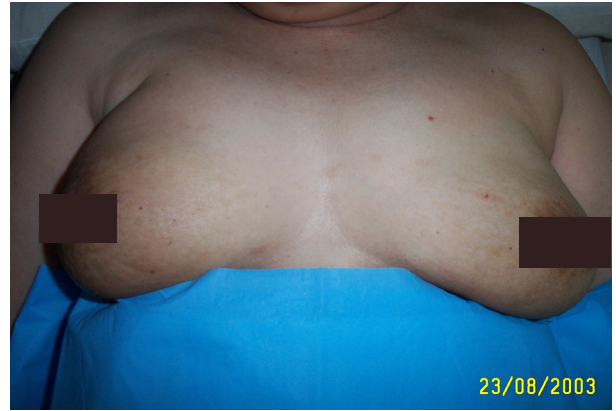
Figure 2. Clinical pictures showing cosmetic outcome after treatment

The Breast cancer is the most common cancer among women. One out of every nine women in United States develops breast cancer (1). It accounted for 31% of all newly diagnosed breast cancer in Malaysia (2). The most common age incidence is in the 5th decades of life which is changing towards 6th decade possibly due to hormone replacement therapy (3). The breast cancers in post-menopausal patients are usually low grade and invariably hormone receptor positive and slow growing. The standard management of operable breast cancers is surgery in conjunction with adjuvant chemotherapy, radiotherapy and hormone therapy. In early stages breast