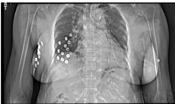
Figure 3. Computer axial tomography topogram showing brachytherapy volume implantation

conservation surgery with axillary lymph node sampling is recommended whereas in relatively advanced cases a standard modified-radical mastectomy with axillary lymph node dissection considered optimal in the current standard. Thus surgery is an integral part of breast cancer treatment. When patient refuse surgery or patient is medically inoperable due to co-morbid medical conditions, oncologists face challenge for a suitable management option (4). With the development of effective chemotherapy and hormone therapy, complete response (CR) rate of around 40% could be easily achievable. Those patients with complete response could be salvaged with radical radiotherapy. Experience from the management