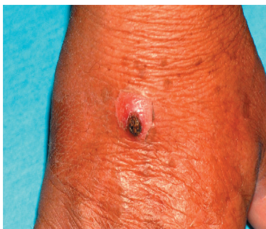
Figure 2. Swelling and redness in the dorsal aspect of patients' right hand where intravenous route had been done.

hypertension and decreased in size with oral antibiotic treatment. These findings suggested septic pulmonary embolus and intravenous 4x1.5 gr of Sulbactam-ampicillin was initiated. Blood culture was taken. No vegetation was observed in echocardiography. The patient's status was significantly improved after the antibiotic treatment; however fever persisted at the fourth day of antibiotic treatment. At the fifth day of treatment, cavities were more distinctly visible and the pleural effusion was increased on chest radiography (Figure 1b). Bilateral, pleural based, relatively thick walled, two cavitory lesions of 3 centimeters in diameter and pleural effusion - massive in