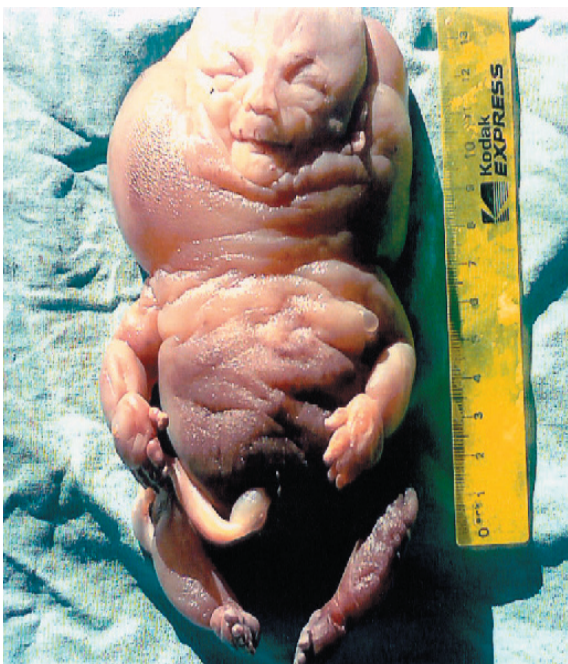
Figure 3. Fetal cystic structures in nuchal region; cystic hygroma

was 70 g in weight and 15x7x5 cm in size. Serial cross sections at web forming tissue at cervical region revealed serous-hemorrhagic fluid containing cystic structure (Figure 4). At microscopic examination immature skin tissue covering cyst wall was seen (Figure 5). On autopsy, there was no cardiac, renal or any other malformation. Chromosomal analysis in cell culture of amniotic fluid revealed 45XO karyotype.