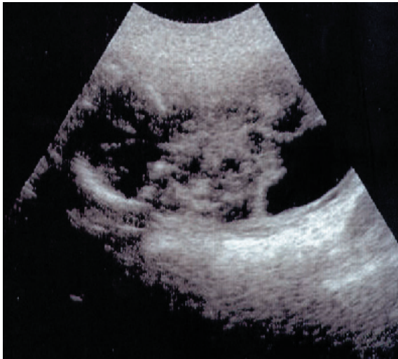
Figure 1. Fetal cystic structures in nuchal region; cystic hygroma

Whole scalp was ecchymotic, the root of nose was flattened and micrognathia was present. Both ears were low onset, at level of mandibula. At left iliac area 1,5x1x0,5 cm sized mass was observed. Lymphedema on foot and hands was present. Nails were hypoplastic. Areolae were separate and unapparent. External genitalia was compatible with female genitalia. The length of umbilical cord was 24 cm and the diameter was 1 cm in thickest portion. The placental material