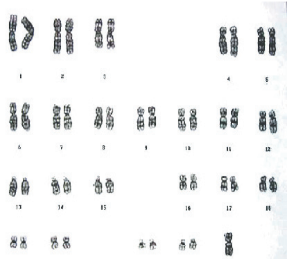
Figure 2. Routine karyotype analysis on cordocentesis revealed 45XO karyotype

Whole scalp was ecchymotic, the root of nose was flattened and micrognathia was present. Both ears were low onset, at level of mandibula. At left iliac area 1,5x1x0,5 cm sized mass was observed. Lymphedema on foot and hands was present. Nails were hypoplastic. Areolae were separate and unapparent. External genitalia was compatible with female genitalia. The length of umbilical cord was 24 cm and the diameter was 1 cm in thickest portion. The placental material