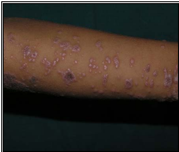
Fig. 3. Papules over the skin with shiny surface and healing the center of the lesion.

the body including the limbs, lower back, chest, peritibial areas, genitalia, face and scalp (Fig 3 and 4). There was appearance of new lesions along the line of trauma (Koebner's phenomenon positive). The patient gave history of moderate itching for 4 months. The nails appeared to be normal. There was neither relevant medical history, drug history nor any family history.