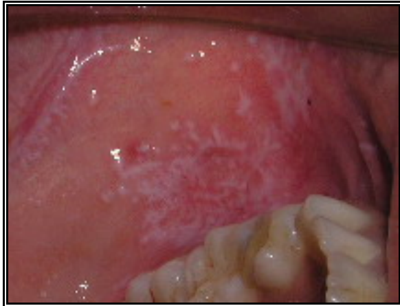
Fig. 2. Intraorally, the lesions appeared as white lacy reticulate pattern on the buccal mucosa.

the body including the limbs, lower back, chest, peritibial areas, genitalia, face and scalp (Fig 3 and 4). There was appearance of new lesions along the line of trauma (Koebner's phenomenon positive). The patient gave history of moderate itching for 4 months. The nails appeared to be normal. There was neither relevant medical history, drug history nor any family history.