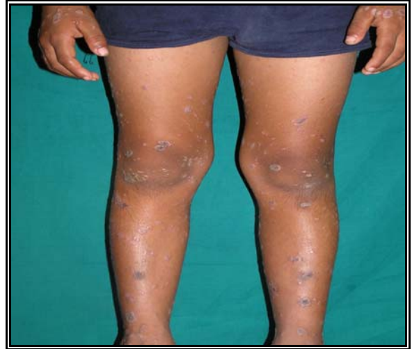
Fig. 4. Papules and plaques were seen symmetrically distributed all over the body like limbs.

progressively and was continued at 2mg/ day for 3 months.