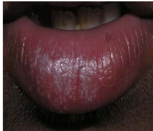
Fig. 1. Diffuse keratotic lesion on lower lip.

Here, we report a case of lichen planus occurring in a young boy of 9 years to emphasize the importance of considering lichen planus in the differential diagnosis of white patches affecting the oral mucosa in childhood.