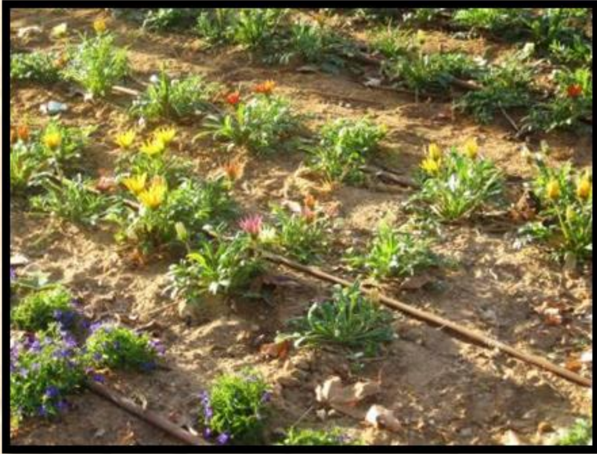
Figure 5. Efficient irrigation (URL-4)