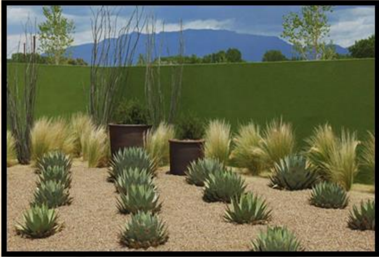
Figure 6. Use of mulch (URL-5)