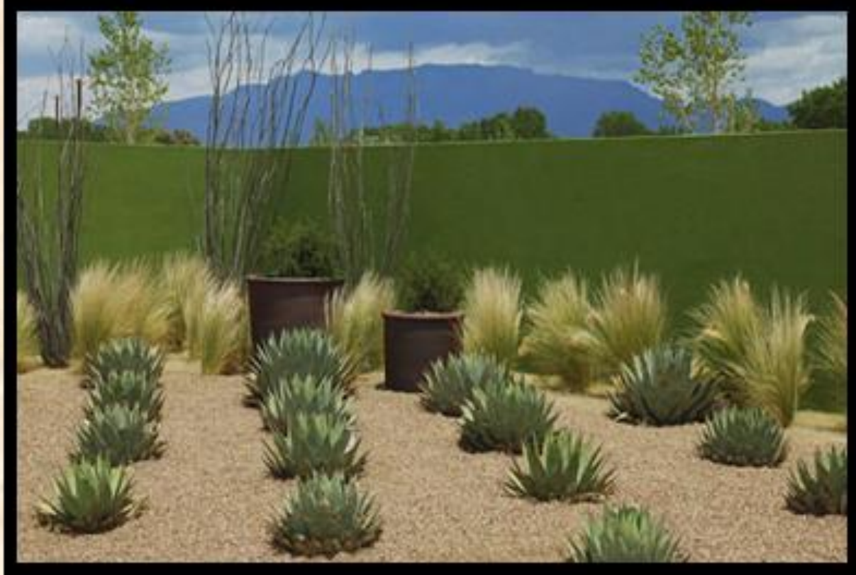
Figure 3. Drought tolerant plants (URL-2).

In Xeriscape type landscapes, plant material should be selected from species that require minimum additional irrigation. Although it is preferred feature that plants can grow using water only from rainfall 18-24 months after planting, all plant species can be used in xeriscape form (Çorbacı vd., 2011).