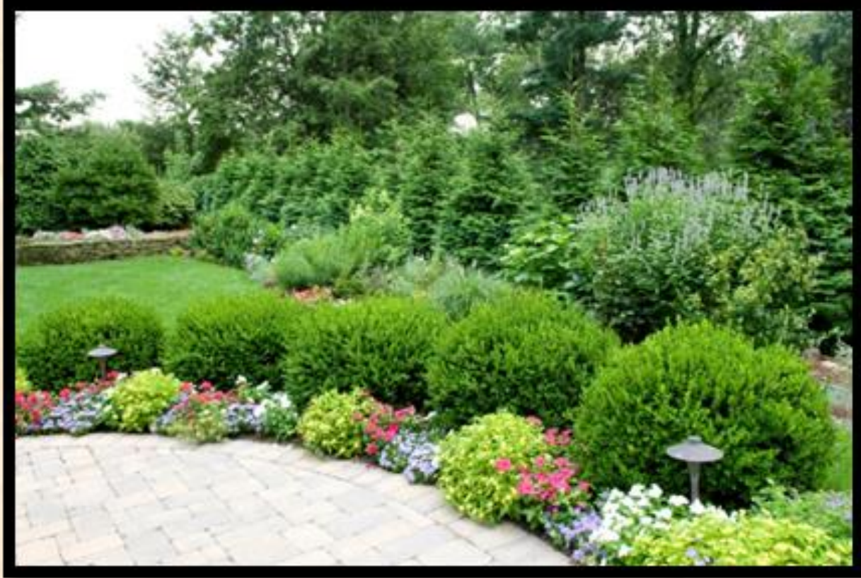
Figure 4. Reducing the rate of lawn (URL-3)