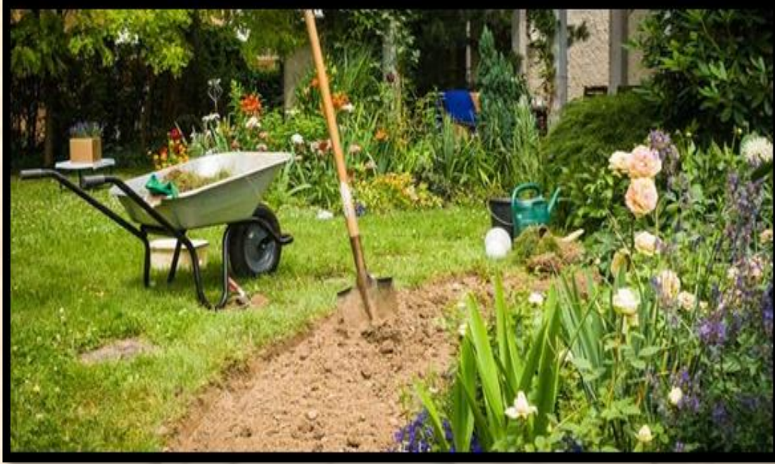
Figure 7. Proper maintenance (URL-6)