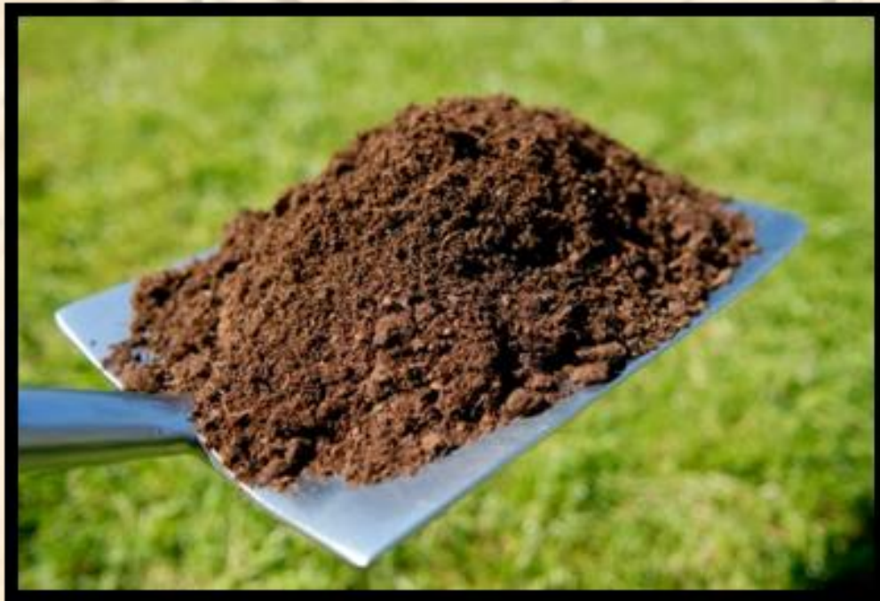
Figure 2. Preparation and improvement of soil (URL-1)

In Xeriscape design, it is very important to determine the soil structure, which is the habitat of plants (Figure 2). Each soil type has its own unique texture, drainage, PH, nutritional value and fertilizer needs. For this reason, the area to be designed should be evaluated in terms of water retention capacity by soil analysis. As a result of the analysis, the organic materials of the soil should be improved and the nutrients needed for the plants should be provided. (Bayramoğlu, 2016).