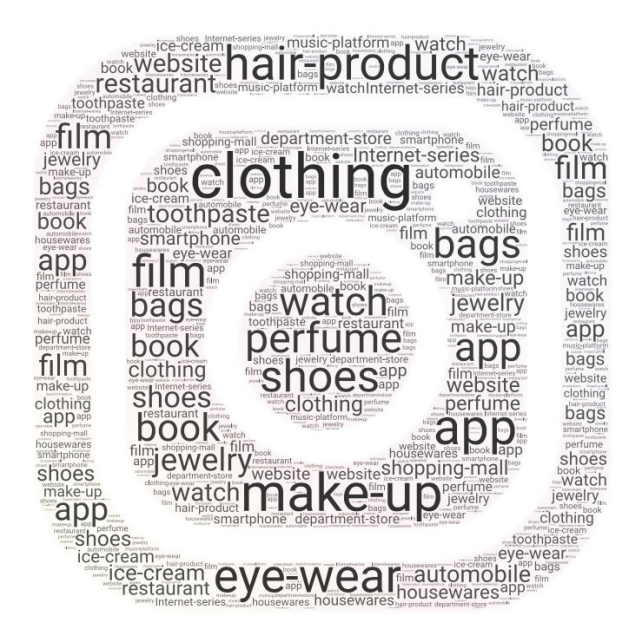
Figure 2: Word Cloud of Product Categories in DIs NPE posts

Table 1 summarizes the NPE posts based on product categories for each DI. The influencer that shared posts from a widest variety of product categories is I7. She shared posts about twelve different product categories. The most shared product category was clothing (f:19) and hair-products (f:19). The second most frequently cited category was make-up (f:10) that was endorsed by 4 influencers. Though evaluated separately in the analysis, make-up can be considered together with perfume (f:8), and skin-care (f:7) as a broader category of cosmetics.