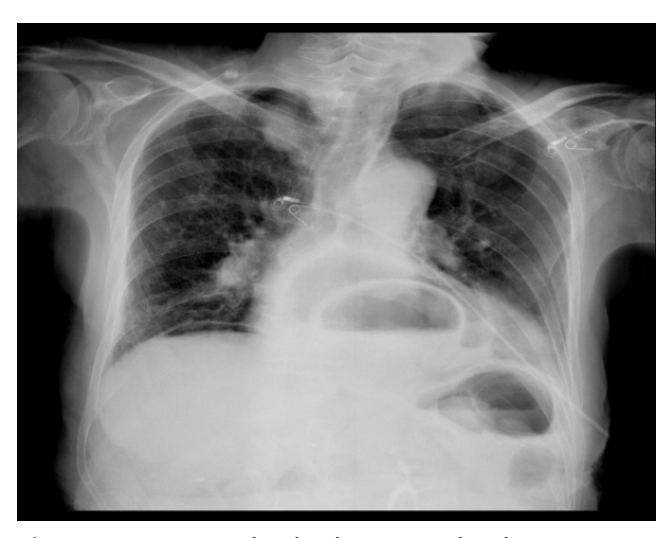
Figure 1: Free air under diaphragm on the chest X-ray

neum and perforation (Figure-2). The patient was consulted general surgery department and the he was undergone emergency surgery with the pre-diagnosis of pneumoperitoneum and perforation by general surgeons.