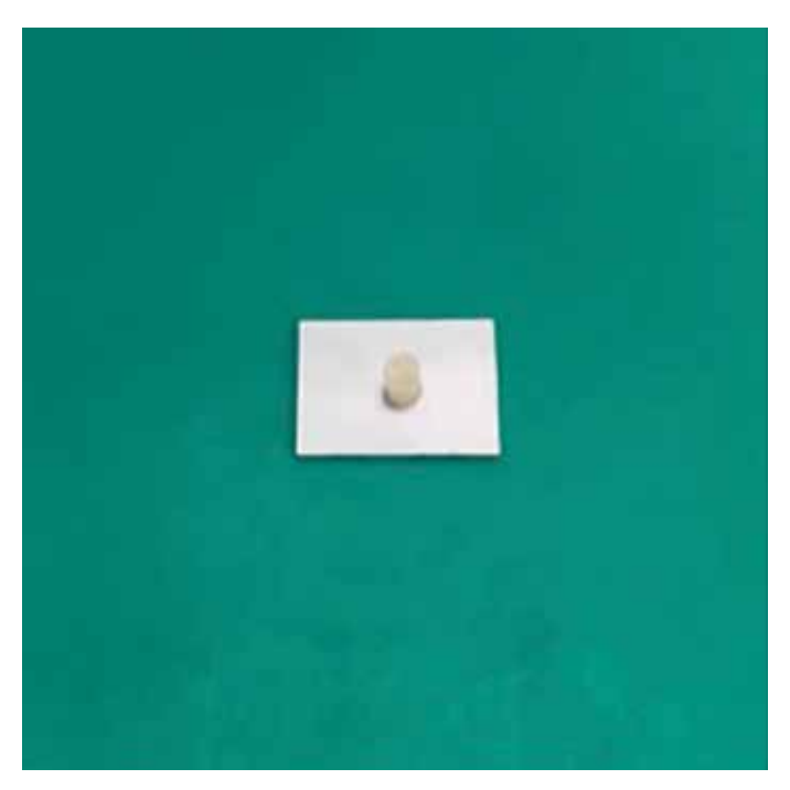
Figure 1. A test sample with 3 mm thick resin layer before being subjected to shear bond strength testing.

MPa: megapascal; SD: standard deviations