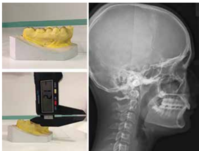
Figure 1. Positioning of the flat surface over the model (upper left) and measurement of the depth of the Spee curve with the digital caliper (lower left) in a patient with Angle Class II malocclusion (right).

a, b: There is no difference in the measurements which were marked with the same letter; NS: Non-significant