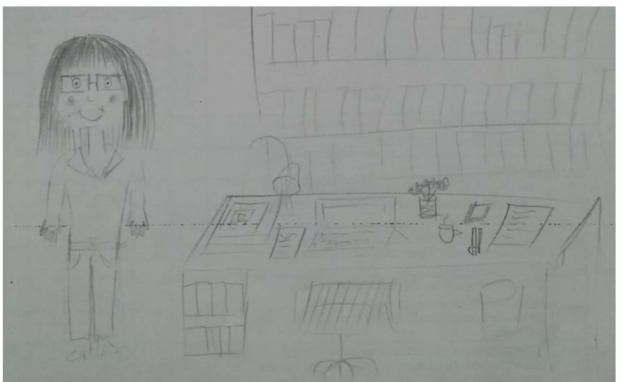
Figure 1. Sample image belongs to a gifted education teacher candidate

* Even though the code of female image was not on the markers as a stereotype, it was included in the table because it was an important finding for study.