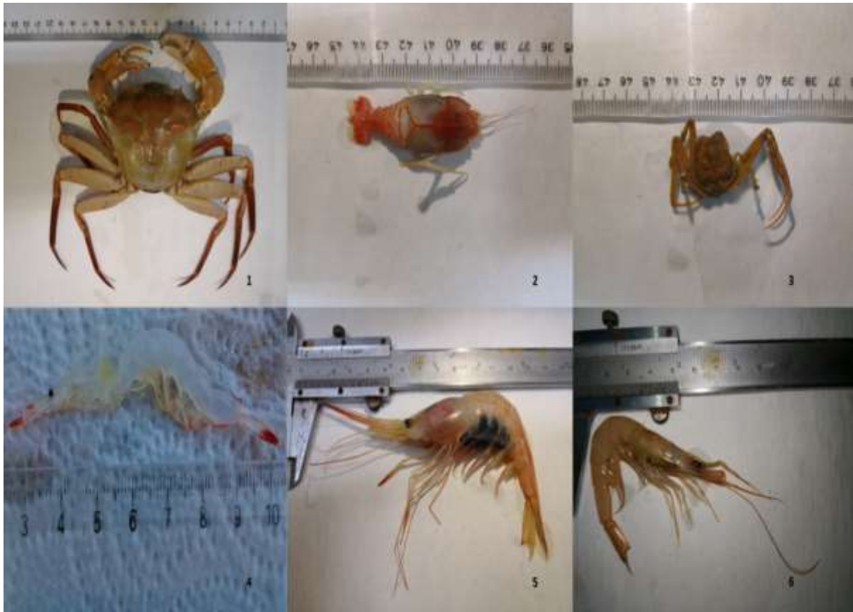
Figure 2. Species of deep-sea decapod crustaceans from Northeastern Mediterranean Sea G.longipes 1 , P. typhlops 2 , M. lanata 3 , P. sivado 4 , P. edwardsii 5 , P. longirostris 6