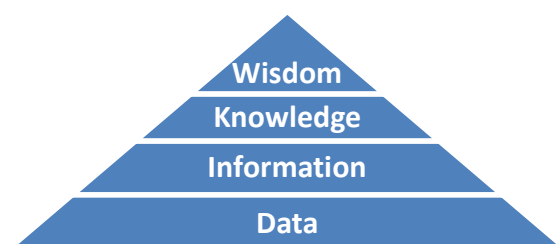
Figure 1. The DIKW hierarchy

An important aspect of selective learning is separating information and knowledge and criticizing the reflections of both two concepts in a correct order. Figure-1 summarizes Ackoff's (1989) data-information-knowledge-wisdom (DIKW) hierarchy, which is a good example of this understanding: