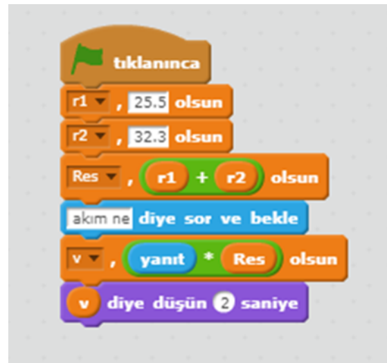
Figure 2.2: Student-18's calculation of the potential difference.