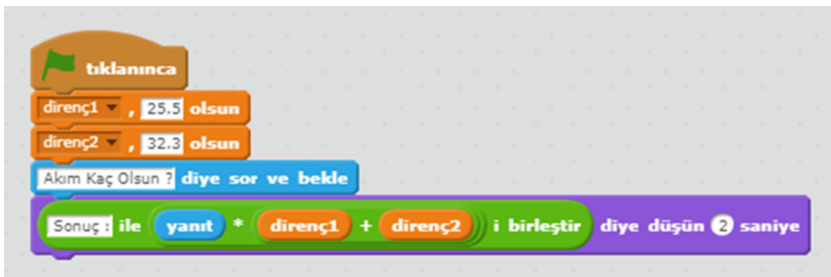
Figure 2.3: Student-20's calculation of the potential difference.

When the codings done by the students regarding the problems in Scratch environment were examined, it was seen that the numbers of sprites and costumes increased from the first