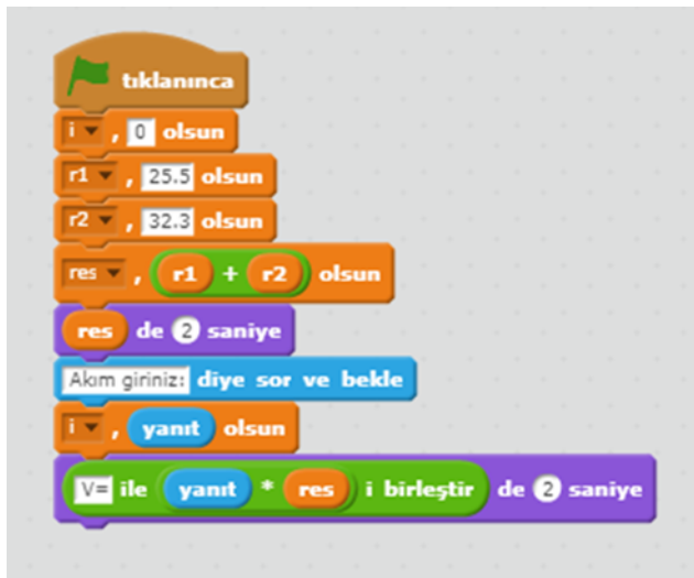
Figure 2.1: Student-1's calculation of the potential difference.

In the application, which involved calculation of the potential difference of a circuit with R_1=25,5 and R_2=32,3 , there were differences between the solutions put forward by three students.