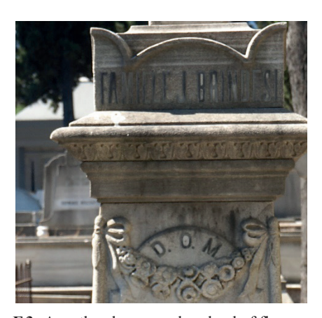
F.3: Acanthus leaves and garland of flowers