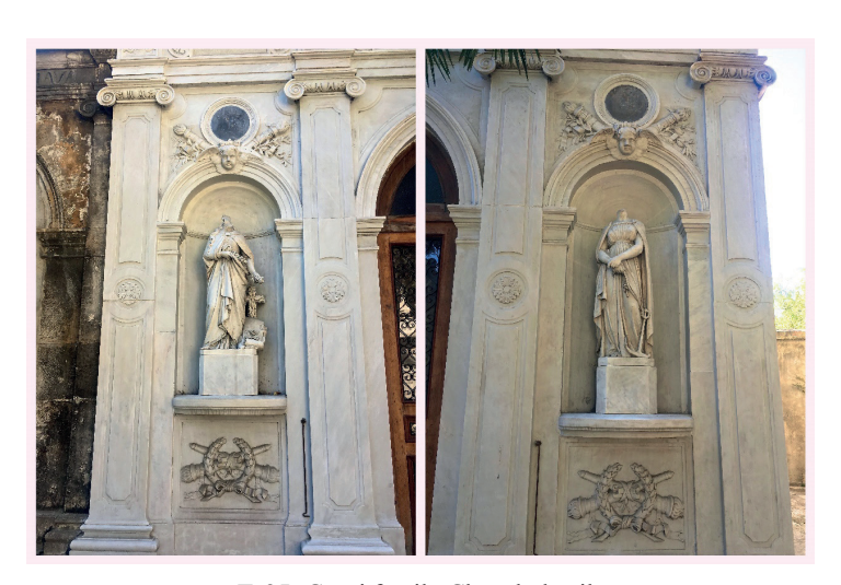
F. 25: Corpi family Chapel, details

Originally from Genoa, the Corpi Family lived in Chios for some time and they came to Istanbul in the 1830's. They were engaged in shipbuilding and banking. Built by Ignazio Corpi as the family residence, the Palazzo Corpi was a magnificent Neoclassical structure in Péra designed by the Italian architect Giacomo Leoni. The building later served as the U.S. Embassy, then served as the U.S. Consulate. The Palazzo Corpi is a private members' club today. The Tubinis also came from Chios and were bankers in Istanbul.<sup>26</sup> They owned vast properties in Kadıköy and the two families were related through marriage.