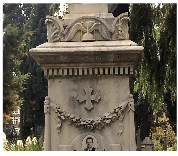
F.12: Scarpello Family tomb, Hourglass with wings, acanthus leaves, dentil molding, and garland of flowers