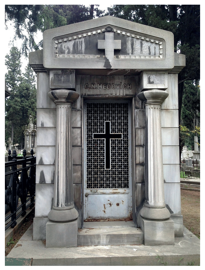
F. 20: Medovich Mausoleum

The northwest wall of the cemetery is lined with monumental funerary chapels belonging to prominent Levantine families of Istanbul (F.21, F.22). Designed as a prostylos temple, the Tubini Family chapel is a rectangular structure with symmetrical layout. The entablature is composed of a series of friezes: there are rows of eggand-dart and dentil molding and acanthus leaves. The name of the family is marked on the architrave with relief letters and there is another frieze of acanthus leaves underneath. The façade is partitioned into three sections by pilasters and the door is set at the center under a curved arch with a keystone. There are reliefs of two large Latin crosses on both sides of the door. The symmetrical scheme of the structure is repeated in the front and there are four fluted columns with ionic capitals supporting