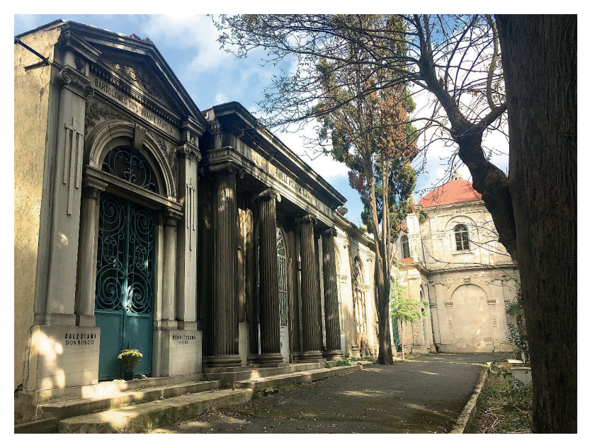
F.21: Funerary chapels

the entablature. The columns have square bases, hence making reference to antique Roman (F. 23: Tubini Chapel)