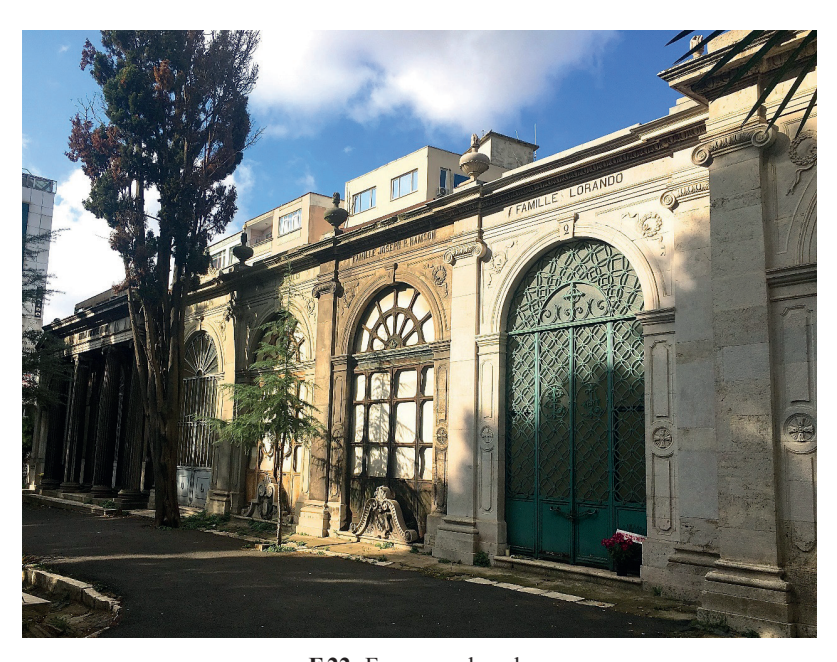
F.22: Funerary chapels