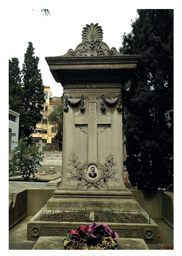
F.7: Antoine Collaro tomb

a large Latin cross with palmettes and Neoclassical motifs is displayed on the pillar. At the base of the cross, an arrangement of olive branches tied with a ribbon frames a photograph. (F.7: Antoine Collaro tomb, F.8: Acroter with Neoclassical details)