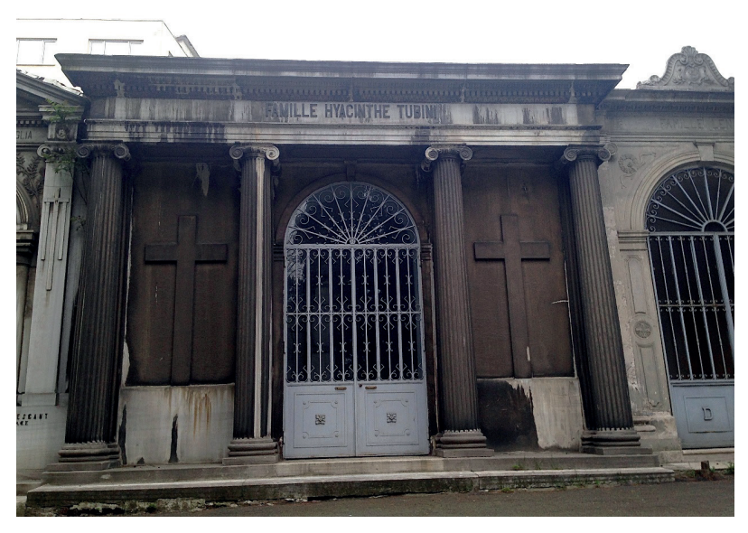
F. 23: Tubini Chapel

The Corpi Family chapel is more elaborate and designed in white marble with exquisite ornaments and details. The acroter is a draped angel with the head missing and is mounted over a decorative element composed of a floral garland, rosettes, volutes and acanthus leaves. Four urns are placed on both sides of the acroter, one pair on each side. The entablature is lined with a row of egg-and-dart molding. The name of the family is written with relief letters on the architrave that displays symmetrical decorations of rosettes and acanthus leaves enclosed in heart forms. The façade is partitioned into three sections by four ionic capital pilasters. The door is set under a curved arch at the center and an angel's head with wings is placed as the keystone. The two sections on both sides of the door have a niche under a curved arch adorned with olive branches and torches tied with ribbons. The angel's head with wings is repeated as the keystone on both niches. A statue of a female figure draped in a cloak is placed in each niche, but the heads are missing. The figure on the right is holding a rope tied to an anchor and the one on the left is holding a bunch of flowers (probably what is left of a broken wreath) and there is a cross and a scroll beside the feet. Both statues are placed on plinths that are decorated by a relief composition of a laurel wreath, ribbon, and two inverted torches crossing diagonally. (F. 24-25: The Funerary Chapel of the Corpi Family)