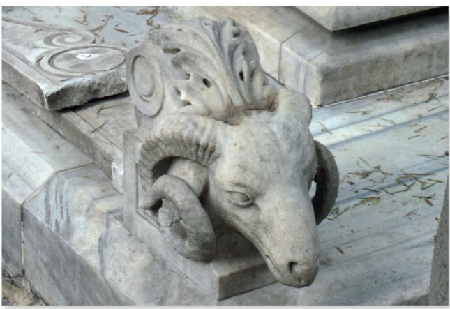
F.10: Gianetti Family tomb, Base with volutes and laurel leaves, ram's head with acanthus leaves

An urn draped in a shroud is mounted over a pillar at the Scarpello tomb that is designed in marble. The curved pediment has the relief of an hourglass with wings that denotes time or life flying away.<sup>22</sup> The horns at the corners are decorated with acanthus leaves and the cornice under the pediment is lined with a frieze of acanthus leaves and dentil molding. A garland of flowers adorns the pillar and the ends of the garland are tied to inverted torches with ribbons. Besides Neoclassical elements, the Scarpello tomb is replete in funerary symbols as well. (F.11: Scarpello Family tomb, F.12: Neoclassical details)