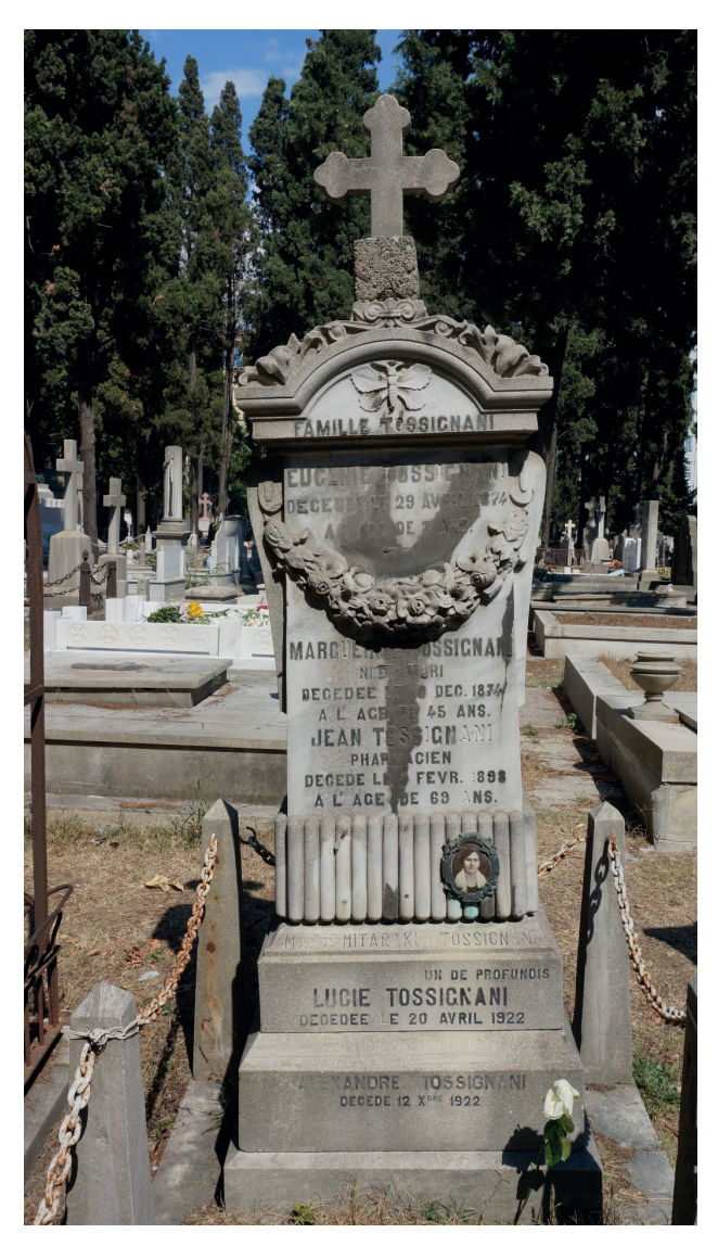
F.14: Tossignani Family tomb

A cross is mounted on a pillar in the Tossignani Family tomb. There are volutes and acanthus leaves arranged in flowing foliage at the base of the cross. The curved pediment of the pillar displays the relief of a butterfly and the pillar is decorated with a lavish garland of flowers and a series of gadroons at the base. (F.14: Tossignani Family tomb)