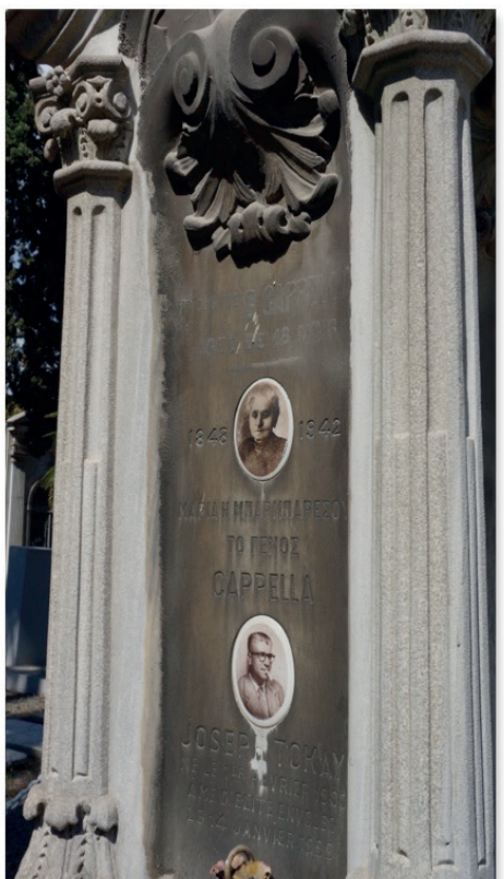
F.5: Cappella Family tomb, Neoclassical details

The Christovics tomb consists of a Latin cross with an olive branch mounted on a pillar. The base of the cross is decorated with a relief of two garlands of flowers tied with a ribbon at the center. There is another garland of laurel leaves on the pillar that has inverted torches at the corners. An ornamental element with acanthus leaves, vo-