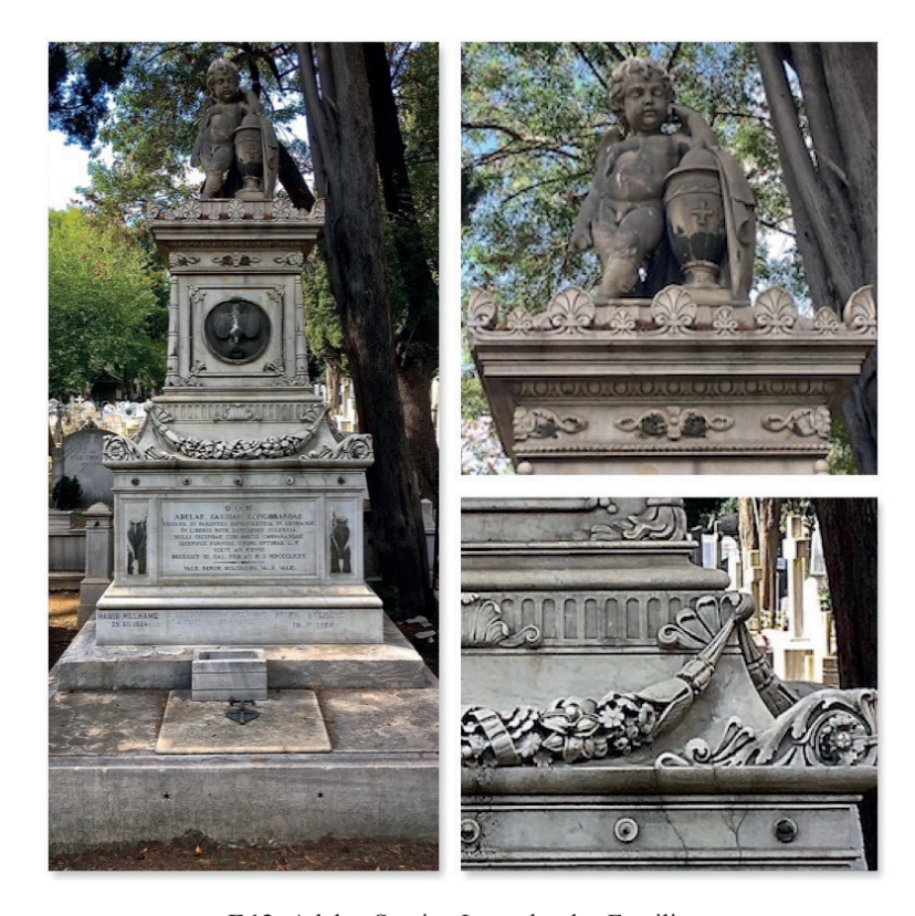
F.13: Adelae-Sassiae-Longobardae Families

The profusely ornate tomb of the Adelae-Sassiae-Longobardae<sup>23</sup> families is quite impressive with the child angel ( putto ) leaning on a draped urn and lavish decorations on the stepped monument. The upper edge displays a row of alternating large and small palmettes. The cornice is lined with egg-and-dart molding and there is a frieze with flowers and acanthus leaves. An inverted dove holding a small wreath in its beak is placed inside a circle formed by a snake biting its own end, which is another funerary symbol representing eternal renaissance, perpetual transformation between life and death. The snake's shedding its skin also makes reference to rebirth and renewal.<sup>24</sup> The base of the tomb has a relief of a garland of flowers with floral rosettes and acanthus leaves at the corners. The child angel, palmettes, egg-and-dart-molding, acanthus leaves, and garlands are elements making reference to the Neoclassical style in this tomb. ( F. 13: The tomb of Adelae-Sassiae-Longobardae families)