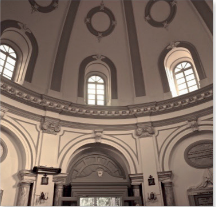
F.1: The Chapel at the Feriköy Latin Catholic Cemetery, Neoclassical details outside the Chapel and the interior