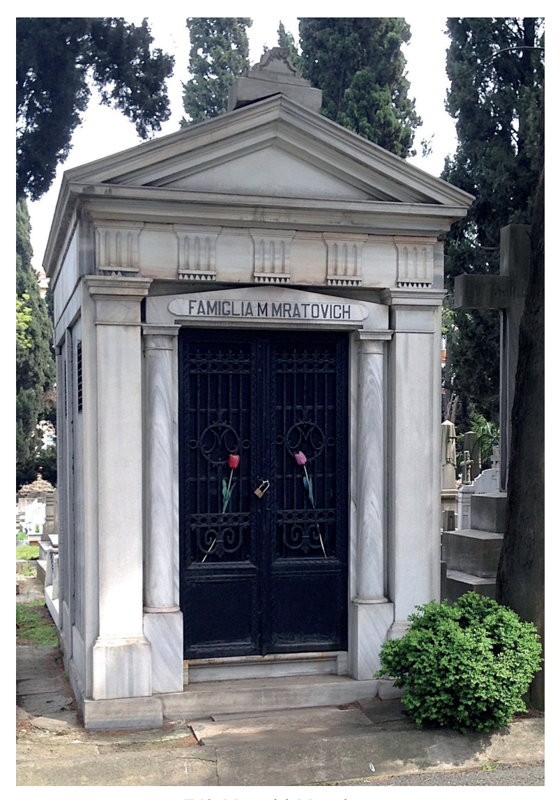
F.19: Mratovich Mausoleum

The tympanum of the Medovich Mausoleum is lined with dentil molding and there is a relief of a cross on the tympanum. The pediment is supported by a pair of dosserets and fluted columns flanking the door to the burial chamber. The stonework in white marble makes reference to the Renaissance style. (F. 20: Medovich Mausoleum)