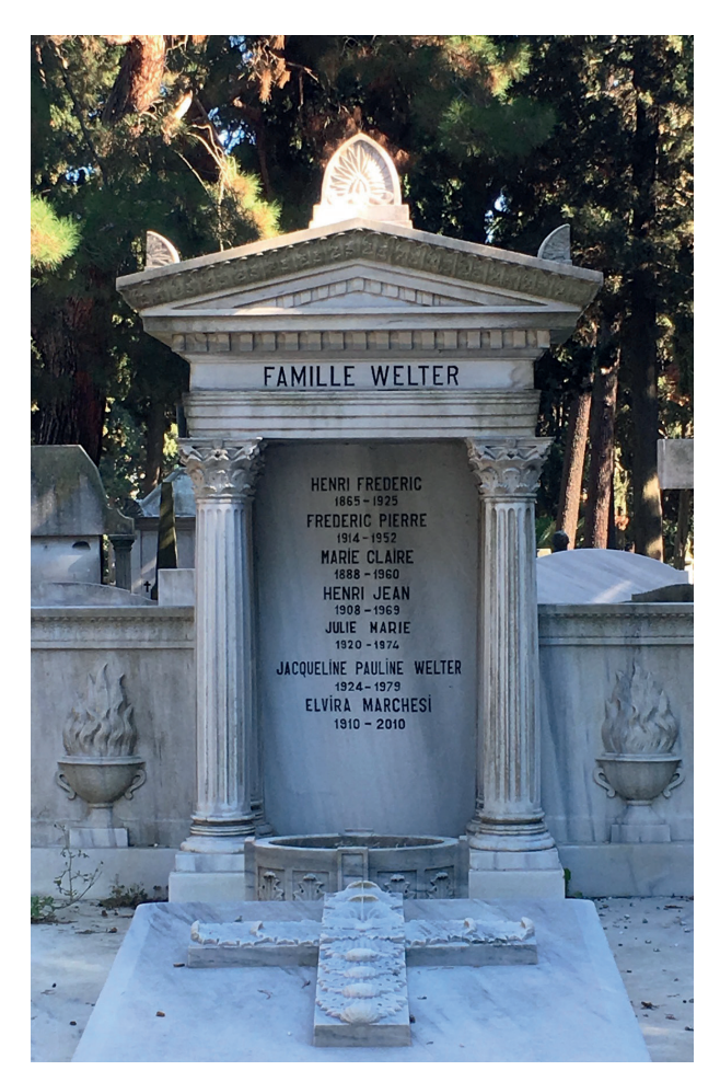
F.16: Welter Family tomb – aedicula