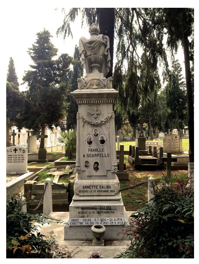
F.11: Scarpello Family tomb