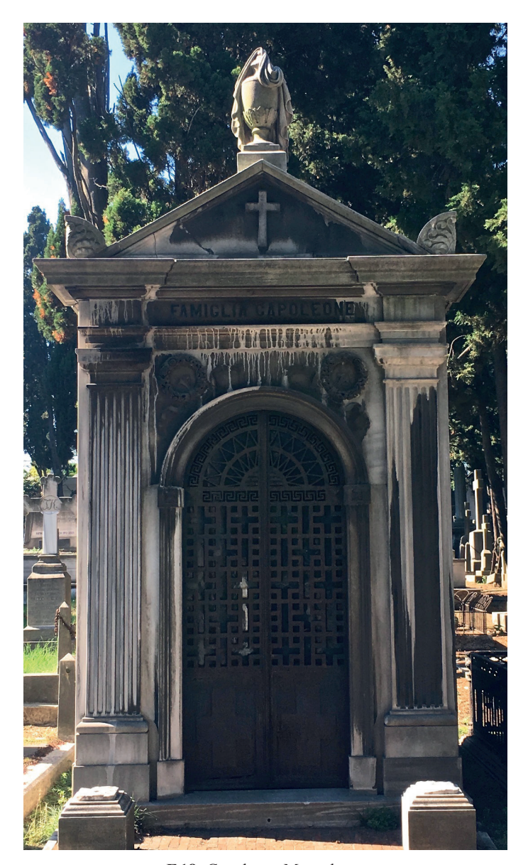
F.18: Capoleone Mausoleum

Another mausoleum designed as a Greek temple is built in white marble for the Mratovich Family. There is a triangular pediment and the entablature is composed of a series of triglyphs and metopes supported by two pilasters. The name of the family is inscribed on a plaque mounted on the architrave and the door is flanked by two half columns (F. 19: Mratovich Mausoleum).