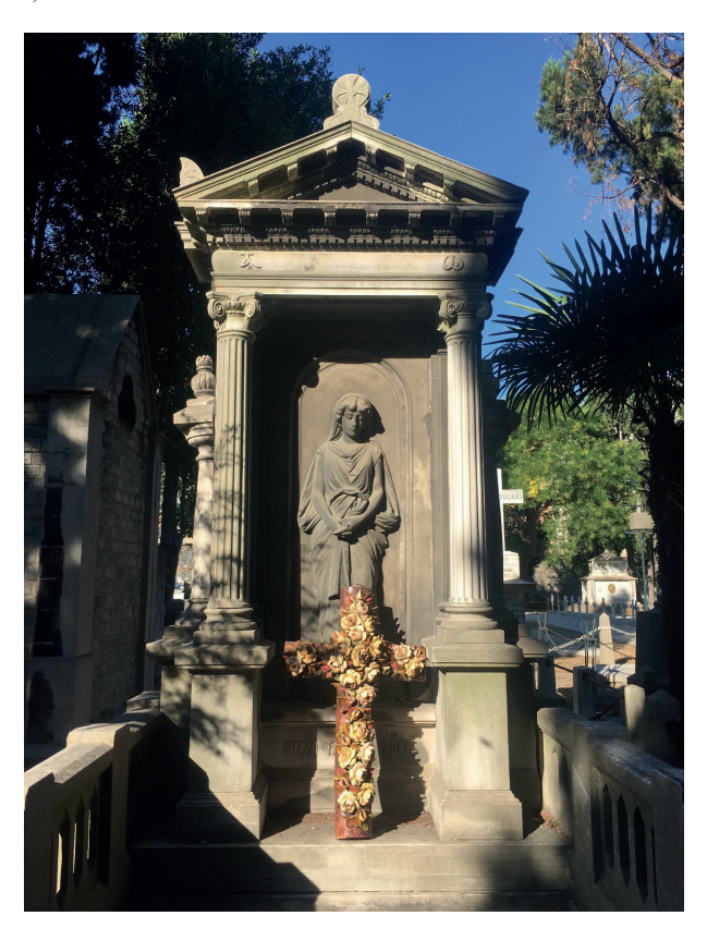
F.15: The Rizzo Family tomb - aedicula

The Welter aedicula is in white marble and has a triangular pediment with an imposing palmette placed at the apex. The eave is lined with a frieze of acanthus leaves and the tympanum with a row of dentil molding. The name of the family is inscribed on the architrave that is supported by two fluted columns with Corinthian capitals. The burial area is covered by a lid that has the relief of a Latin cross decorated by acanthus leaves (F.15: The Rizzo Family tomb - aedicula ) (F.16-17: Welter Family tomb - aedicula ).