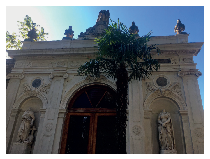
F. 24: The Funerary Chapel of the Corpi Family