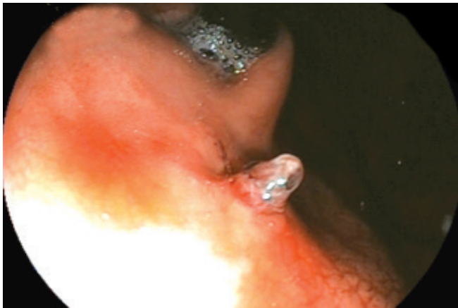
Figure 1. Dieulafoy's lesion on the lesser curvature near the cardia.

the standard diagnostic and therapeutic method for bleeding DLs (3). Endoscopic interventions, such as band ligation, thermocoagulation with heater probe, bipolar electrocoagulation, photocoagulation, injection therapy, and endoscopic hemoclip application, are among the first choices in the ther-