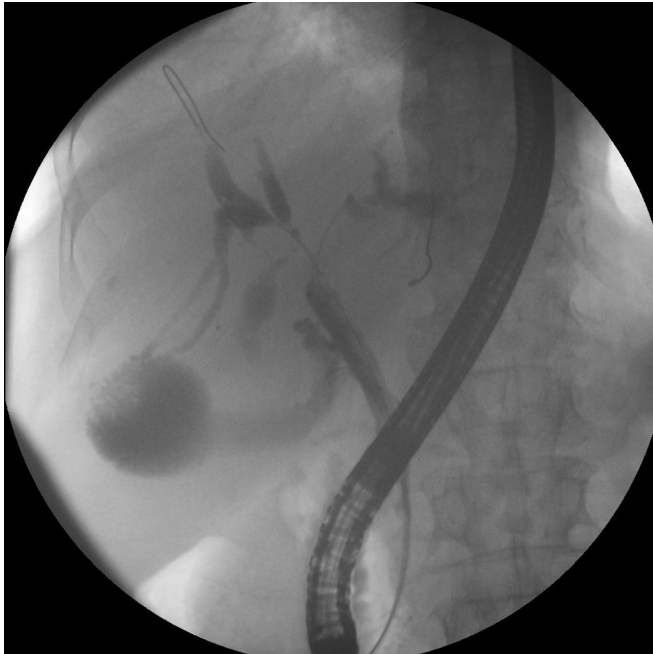
Figure 2. Malignant hilar stenosis.