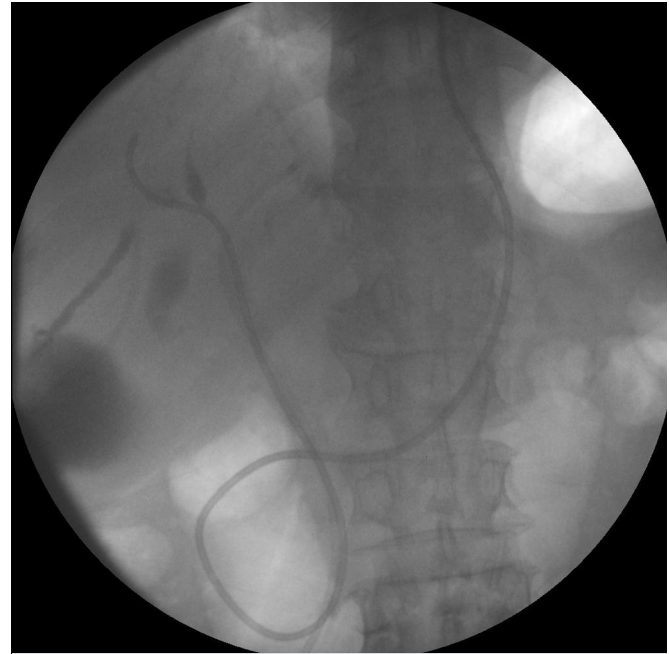
Figure 3. Nasobiliary drain and stent placed by crossing over the stenosis.