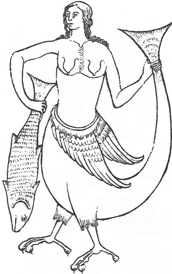
Fig. 1 The Siren as commonly depicted in the bestiaries ( White 135)

In addition to the descriptions and illustrations of the mermaid/siren figure that appeared in the bestiaries, the stories related to them also had their roots in the folk ballads and tales of the northern seafaring nations. It seems that