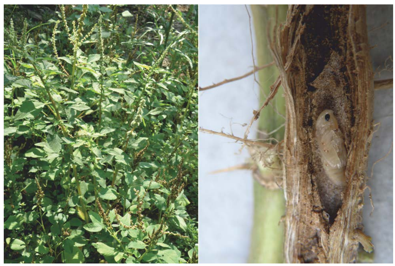
Figure 2. Amaranthus spinosus (left), feeding damage of the larva of Hypolixus pica in the root of A. spinosus (right) (Gültekin & Korotyaev, 2012).

Pourtaherzarei et al. (2010) noted that the adults of H. pica fed on the leaves and seeds of A. retroflexus in Iran. In Turkey, although Gültekin & Korotyaev (2012) did not give any information about the feeding habits of the weevil, they found that larvae definitely fed on the roots of A. spinosus and completely destroyed the root system (Figure 2). However, in Antalya the larval host of the weevil could not be detected. There has been no any record of occurrence of A. spinosus in Antalya. Concerning the larval host plant of H. pica , there are two possibilities: firstly, the distribution range of A. spinosus has reached Antalya, secondly, the larvae of H. pica feed on another Amaranthus species in Antalya.