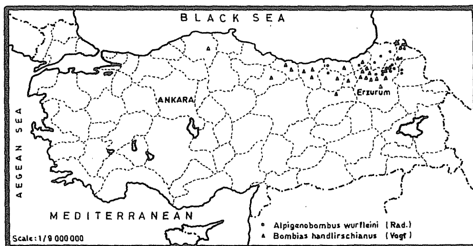
Map 2. Distribution of Alpigenobombus wurfleini and Bombias handlirschianus in Turkey

This species is found in relatively small numbers in north eastern of Anatolia (Map 2).