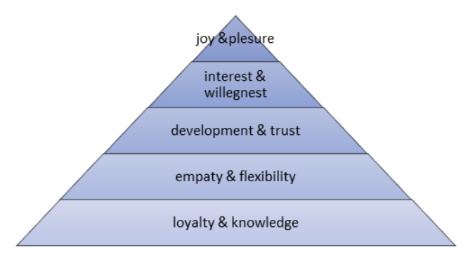
Figure.1. Ten Great Elements In The Emotional Labor Process

The emotional labor laws that organizations put forward affect emotional labor demonstrations. These rules must be executed correctly and effectively. It depends on the construction of each parameter that makes up the specified rules with the most accurate and most humanistic approach, taking care of the whole with sensitivity. In addition to emotional labor laws, there are also different parameters affecting emotional labor performances. The basic parameters that guide the emotional labor during emotional labor demonstrations are ten great parts: