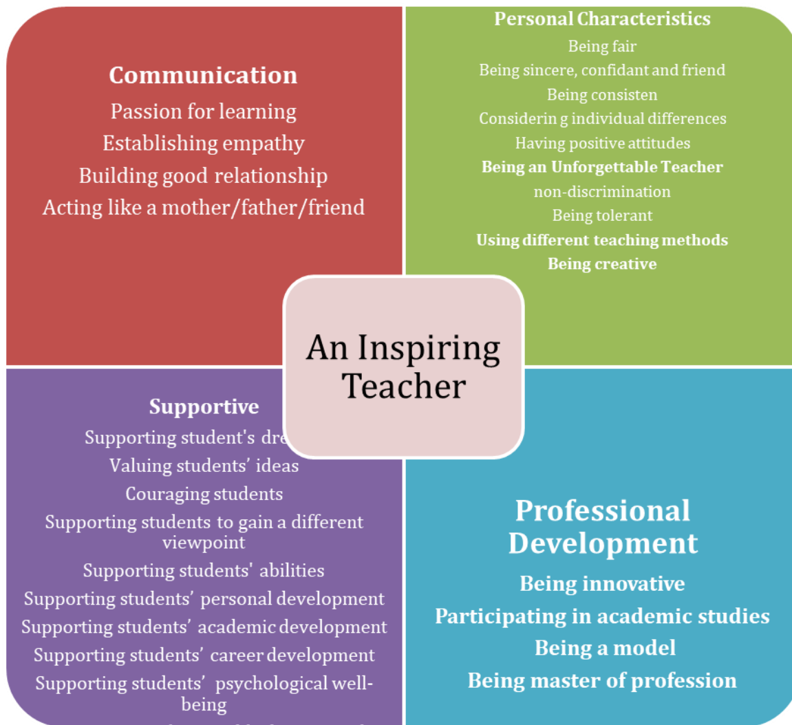
Figure 2. The categories and subcategories of the inspiring teacher

The results of this study demonstrated the characteristics that an inspiring teacher should have according to the opinions of teacher candidates. These findings that are related to the characteristics of an inspiring teacher can be discussed in the light of the related literature. Thus, it is necessary to review the previous studies that focused on characteristics of teacher.