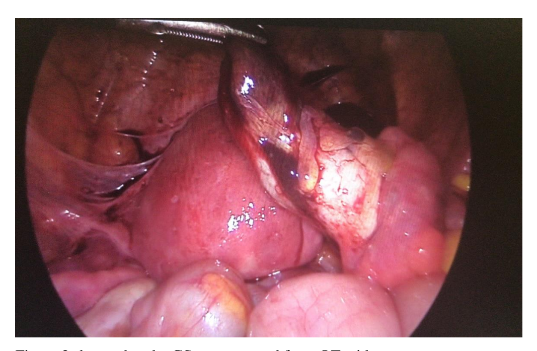
Figure 2 shown that the GS was exracted from OT with ease.