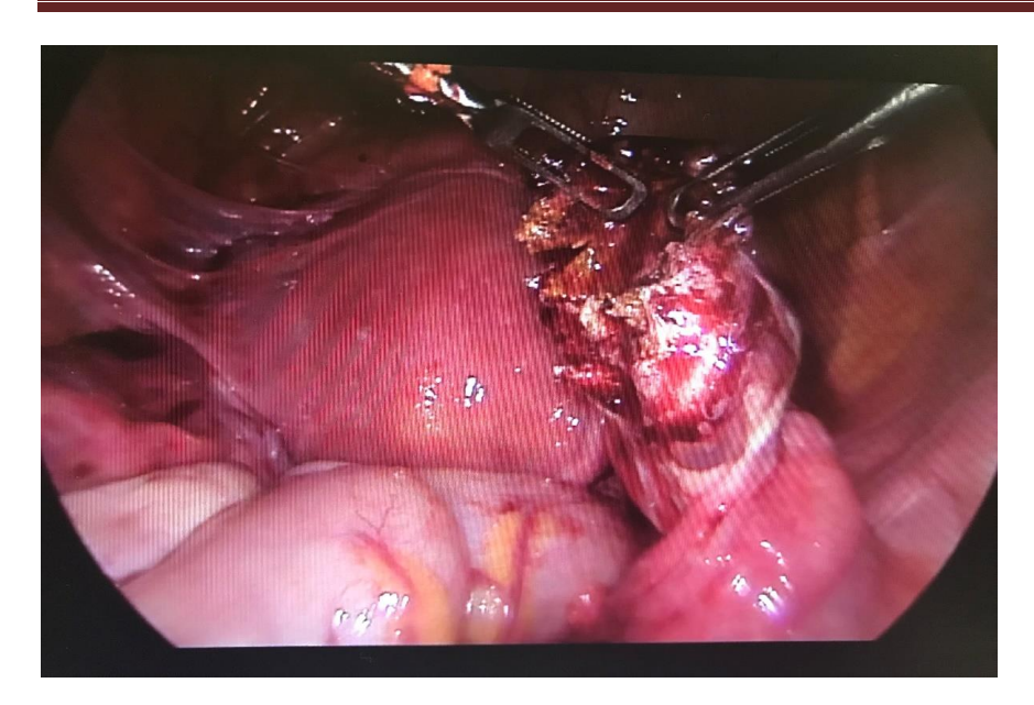
Figure 3. shown that a wedge resection was performed