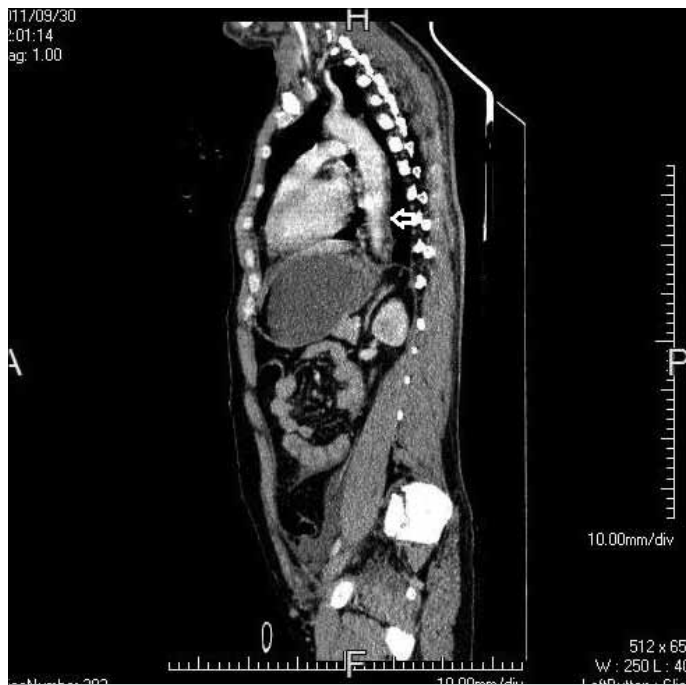
Figure 1. Intramural aortic hematoma. Thickening of aortic wall