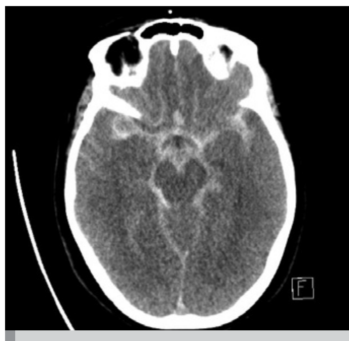
Figure 2. Cranial CT before PTCA shows diffuse subarachnoid hemorrhage and an aneurysm in the right MCA